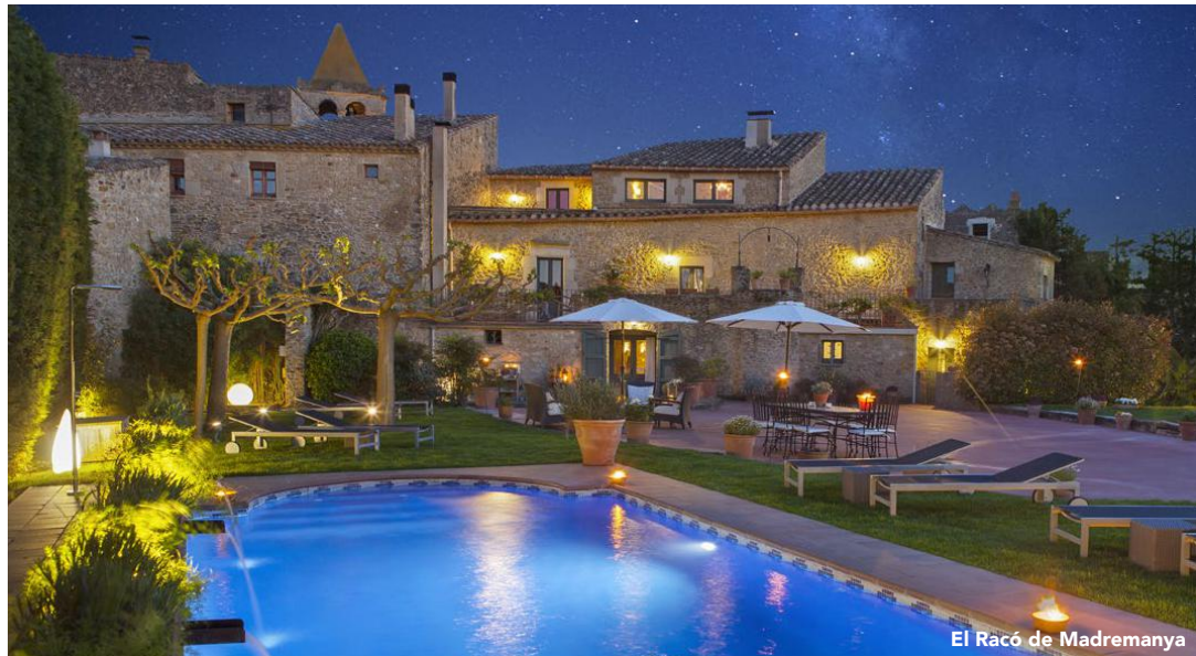
El Racó de Madremanya