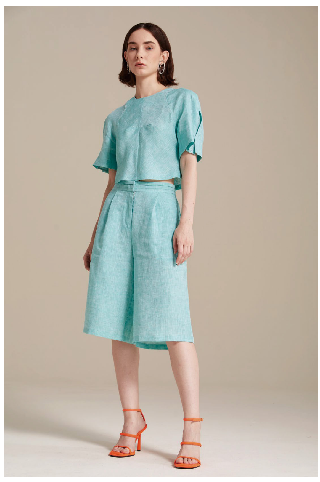
TOP / 24C532-TB SHORT / 24C586-TB