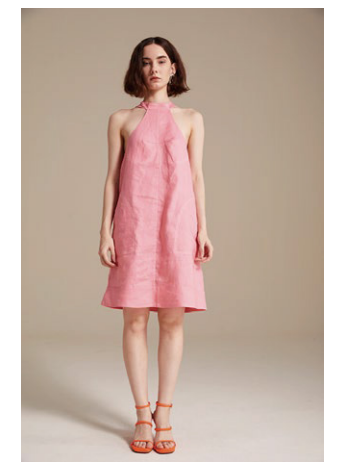
DRESS / 24C578-R LOOK 20