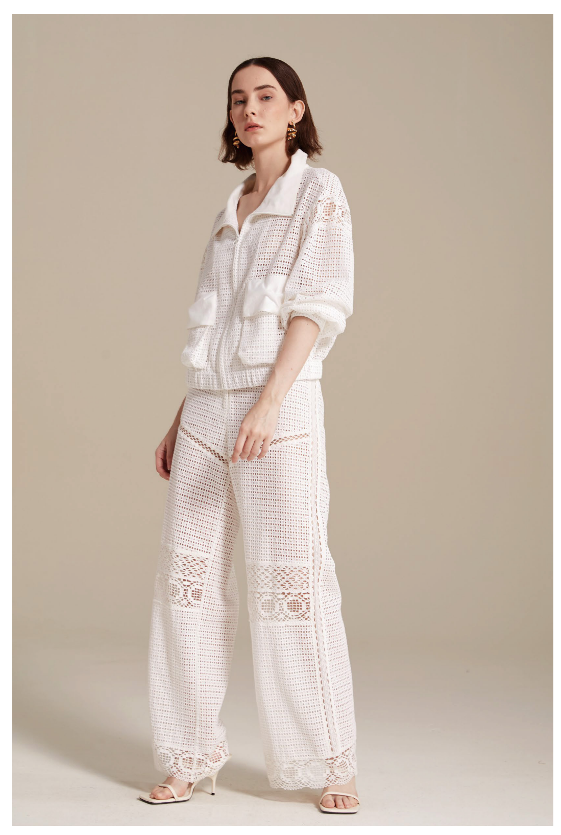
JACKET / 24C576-W TROUSERS / 24C526-W