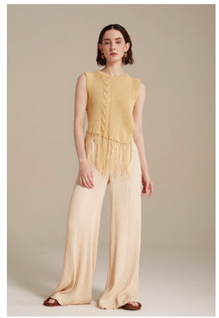
KNIT VEST / 24C552-Y TROUSERS / 24C556-RW