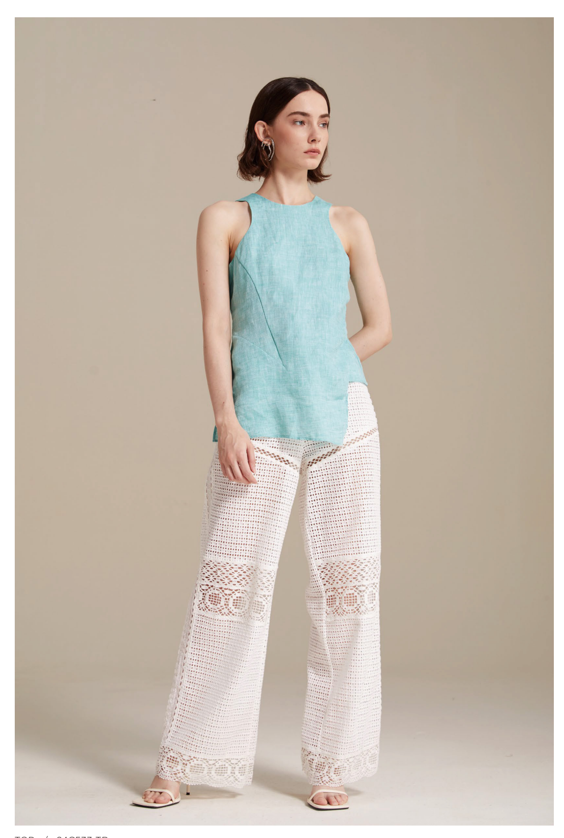
TOP / 24C533-TB TROUSERS / 24C526-W