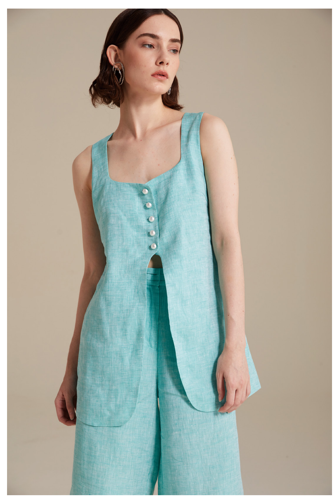
TOP / 24C543-TB SHORT / 24C586-TB