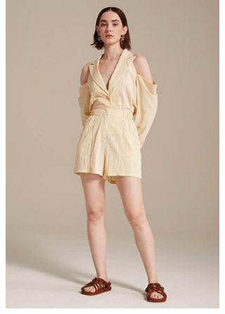
SHIRT / 24C558-Y SHORT / 24C584-Y