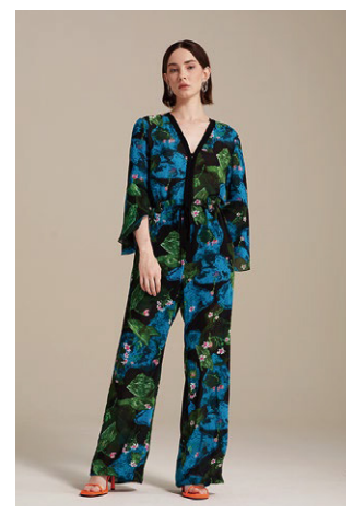
JUMPSUIT / 24C559-FB LOOK 21