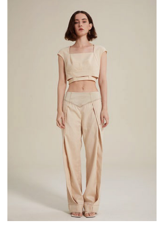
TOP / 24C523-RW TROUSERS / 24C527-E