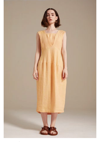
DRESS / 24C567-Y LOOK 32