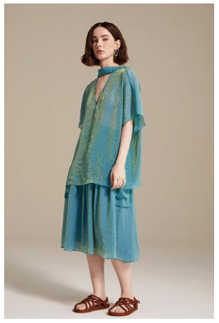
BLOUSE / 24C529-B SKIRT / 24C583-B