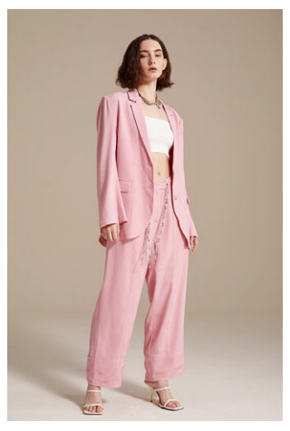
JACKET/ 24C574-RF TROUSERS / 24C570-R