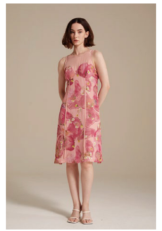
DRESS / 24C568-FR