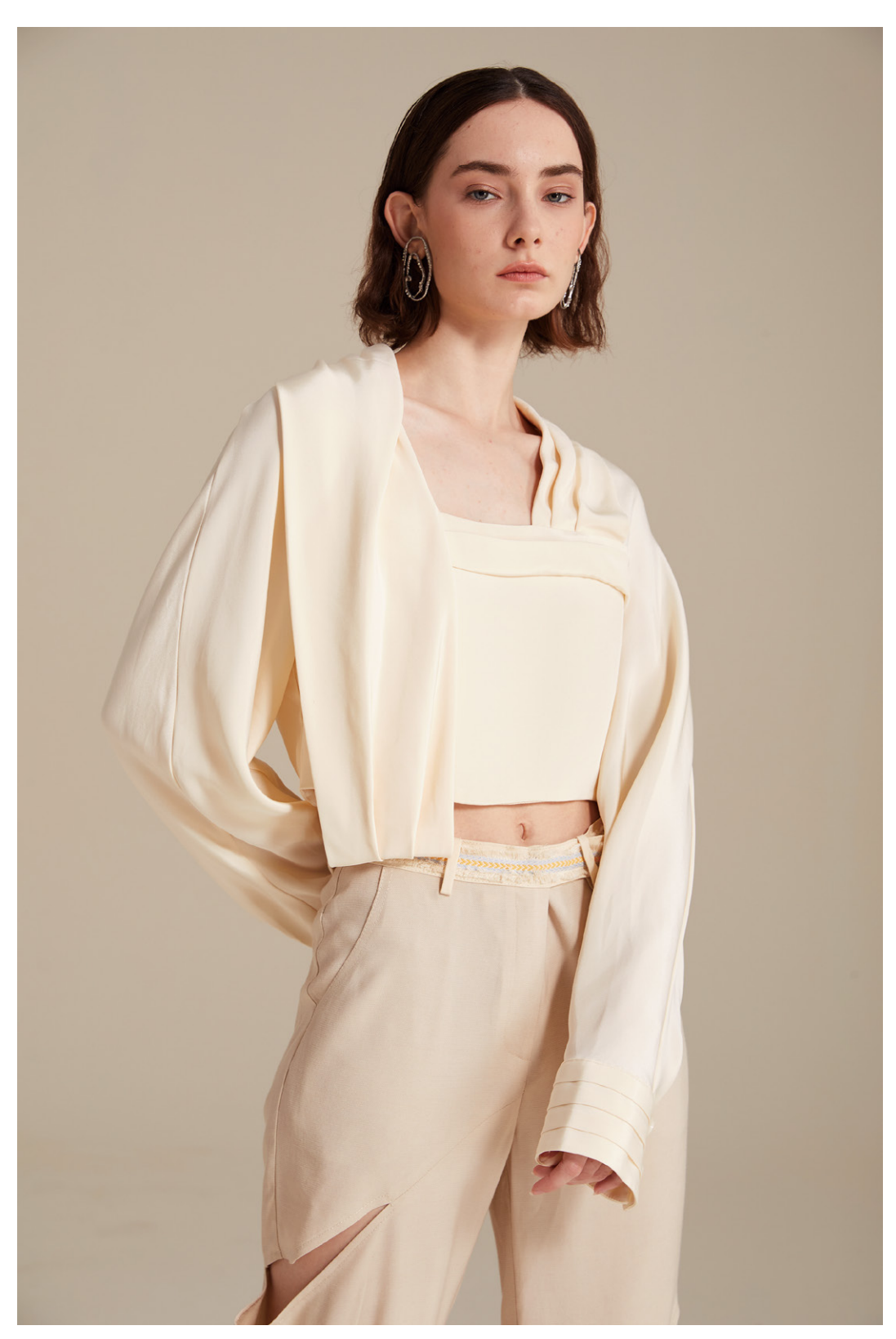
SHIRT / 24C563-RW TROUSERS / 24C551-RW