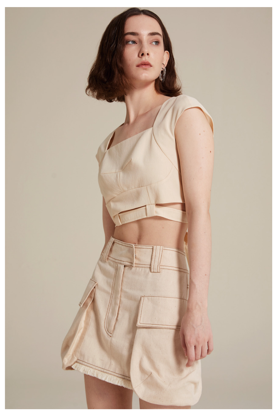
TOP / 24C523-RW SKIRT / 24C560-1-E