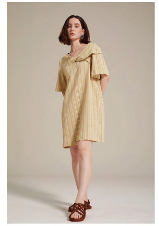
DRESS / 24C550-YG LOOK 31