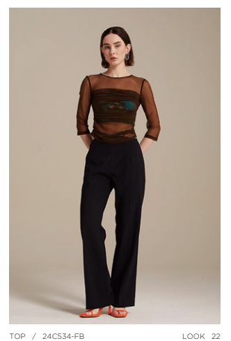
TOP / 24C534-FB TROUSERS / 23C388-I