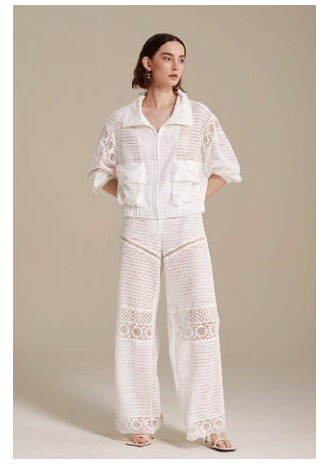
JACKET / 24C576-W TROUSERS / 24C526-W