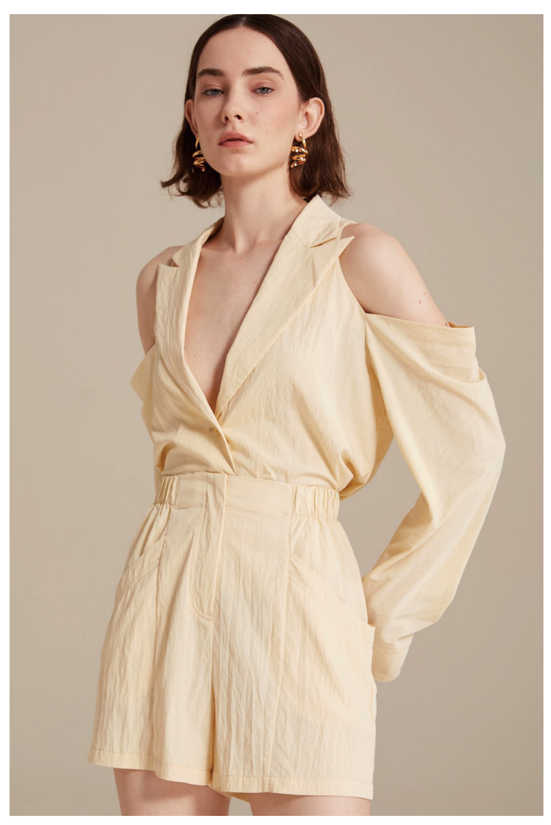
SHIRT / 24C558-Y SHORT / 24C584-Y