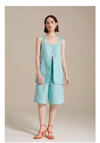
TOP / 24C543-TB SHORT / 24C586-TB