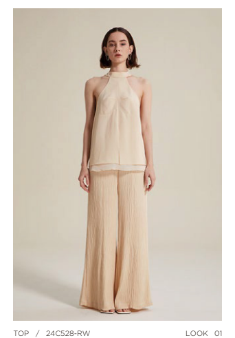
TOP / 24C528-RW TROUSERS / 24C556-RW