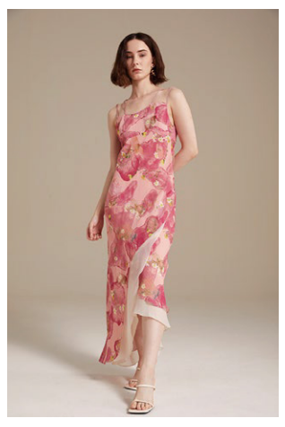
DRESS / 24C525-FR