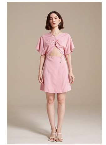
DRESS / 24C573-R