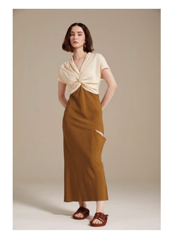
DRESS / 24C545-RWO