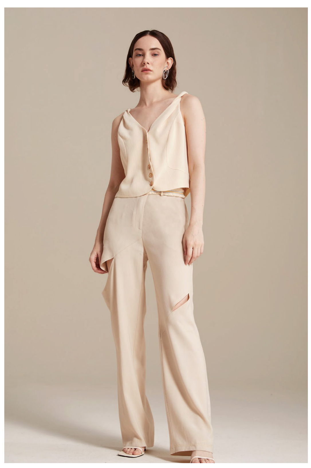
WAISTCOAT / 24C549-RW TROUSERS / 24C551-RW