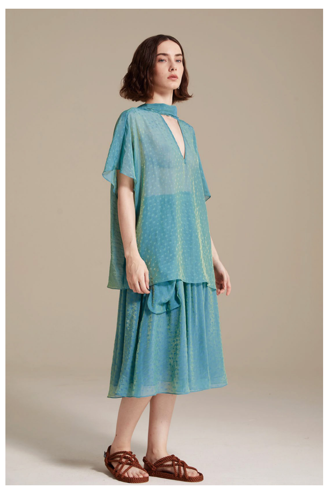
BLOUSE / 24C529-B SKIRT / 24C583-B