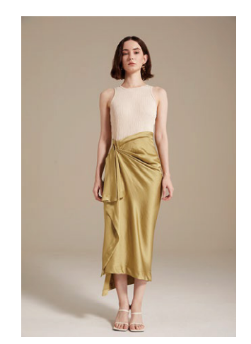
DRESS / 24C546-RWG