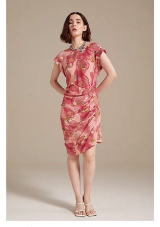
DRESS / 24C536-FR