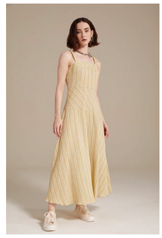
DRESS / 24C575-YG LOOK 33