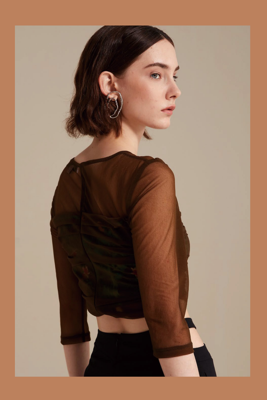
TOP / 24C534-FB TROUSERS / 23C388-I

The main pattern of the collection is undoubtedly this anthemis flower, which almost resembles a daisy. A resilient flower that grows against all odds, on rocky lands, as a symbol of life triumphing over adversity. Creating a visual harmony that evokes perfection while recalling the force of nature.