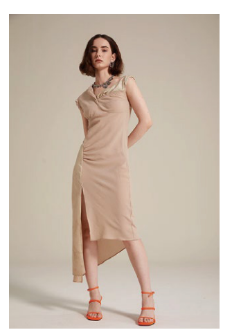
DRESS / 24C535-B