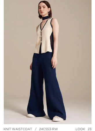
KNIT WAISTCOAT / 24C553-RW TROUSERS / 24C566-B