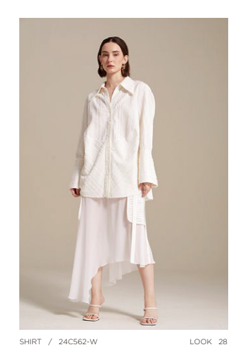
SHIRT / 24C562-W SKIRT / 24C541-W