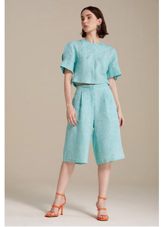
TOP/ 24C532-TB SHORT / 24C586-TB