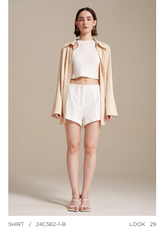
SHIRT / 24C562-1-B TOP / 24C580-W SHORT / 24C579-W