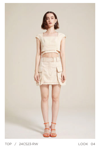
TOP / 24C523-RW SKIRT / 24C560-1-E