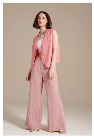
WAISTCOAT / 24C569-R TROUSERS / 24C566-R