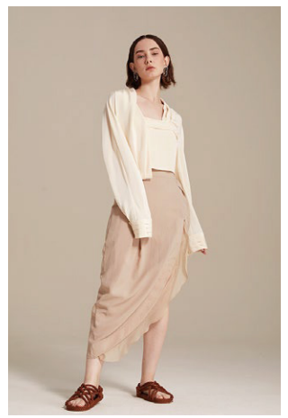
SHIRT / 24C563-RW SKIRT / 24C524-B