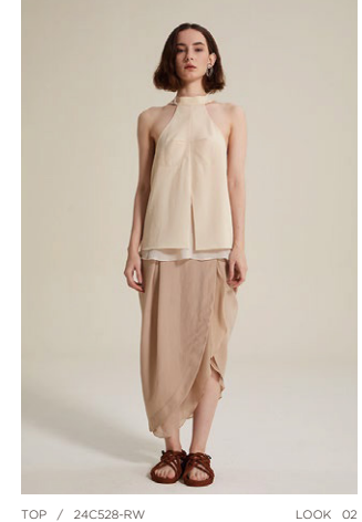
TOP / 24C528-RW SKIRT / 24C524-B