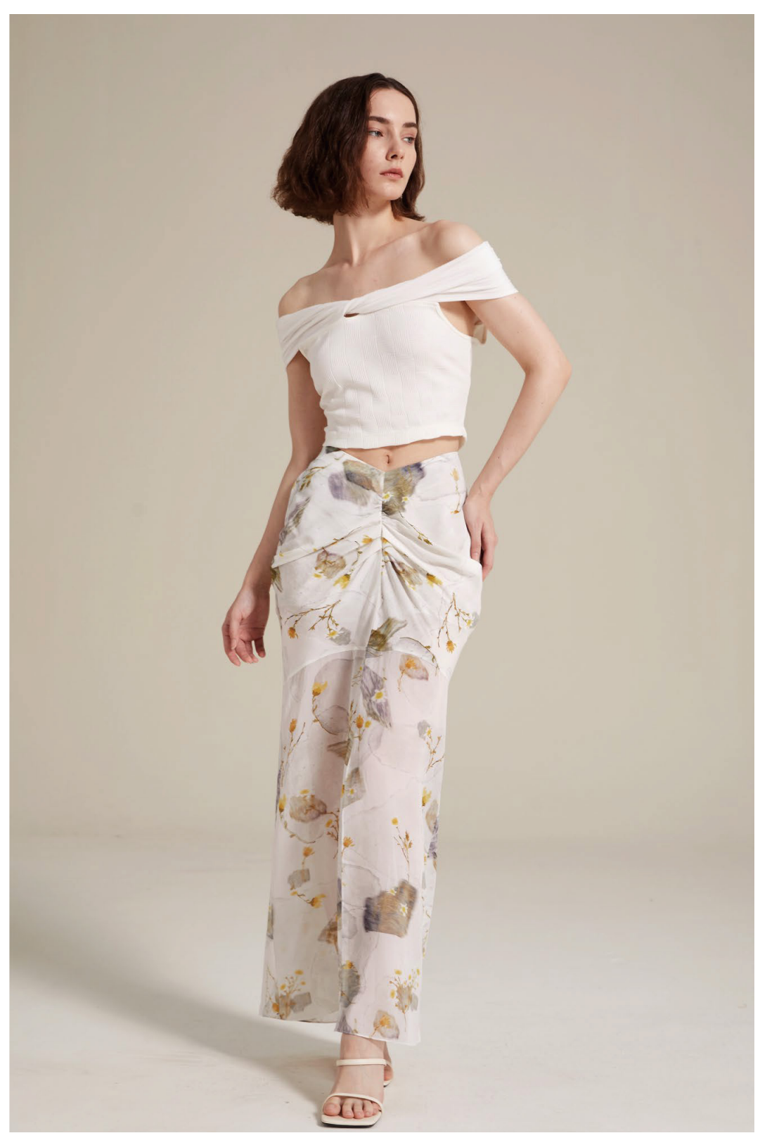
TOP / 24C581-W SKIRT / 24C538-FG