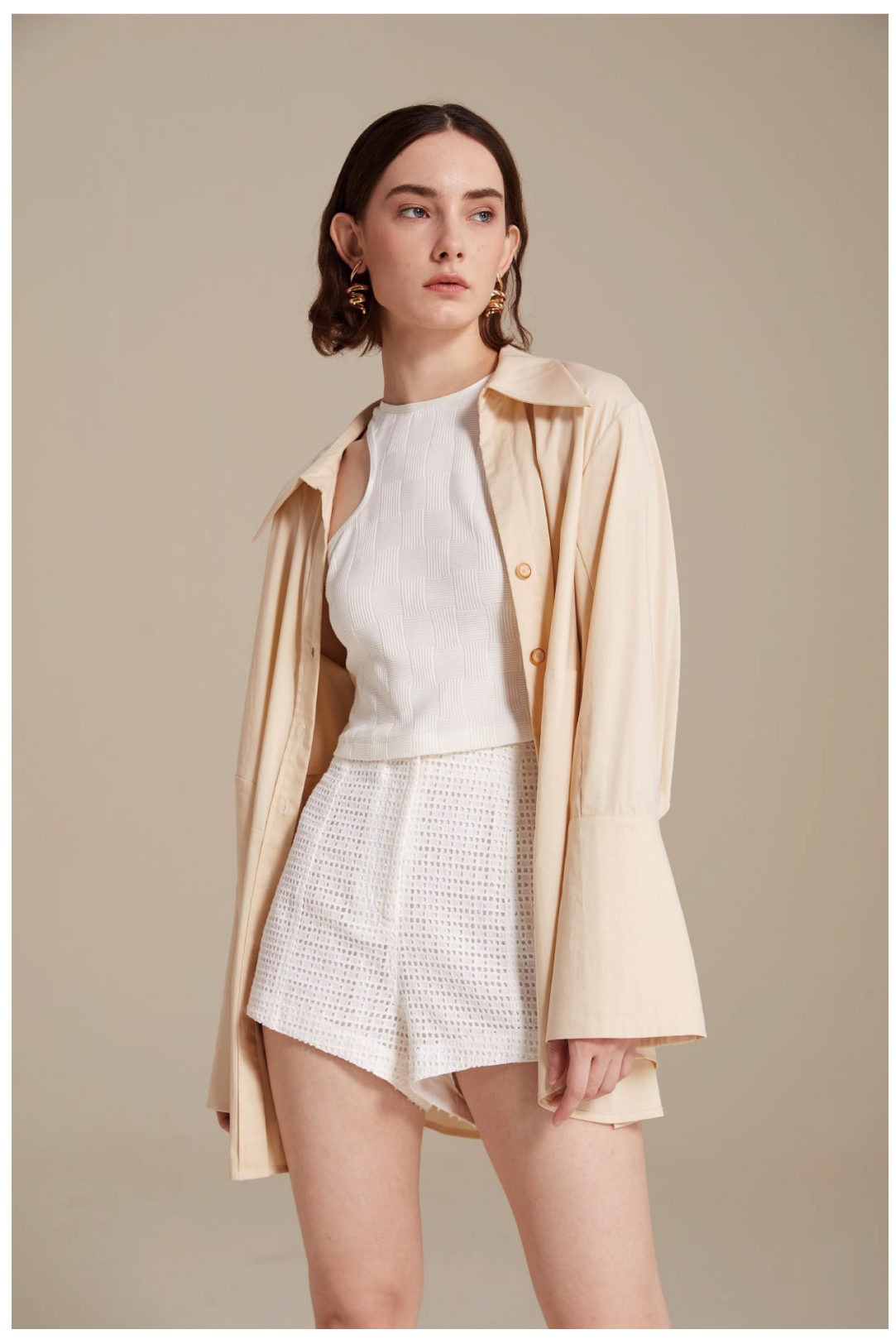
SHIRT / 24C562-1-B SHORT / 24C579-W