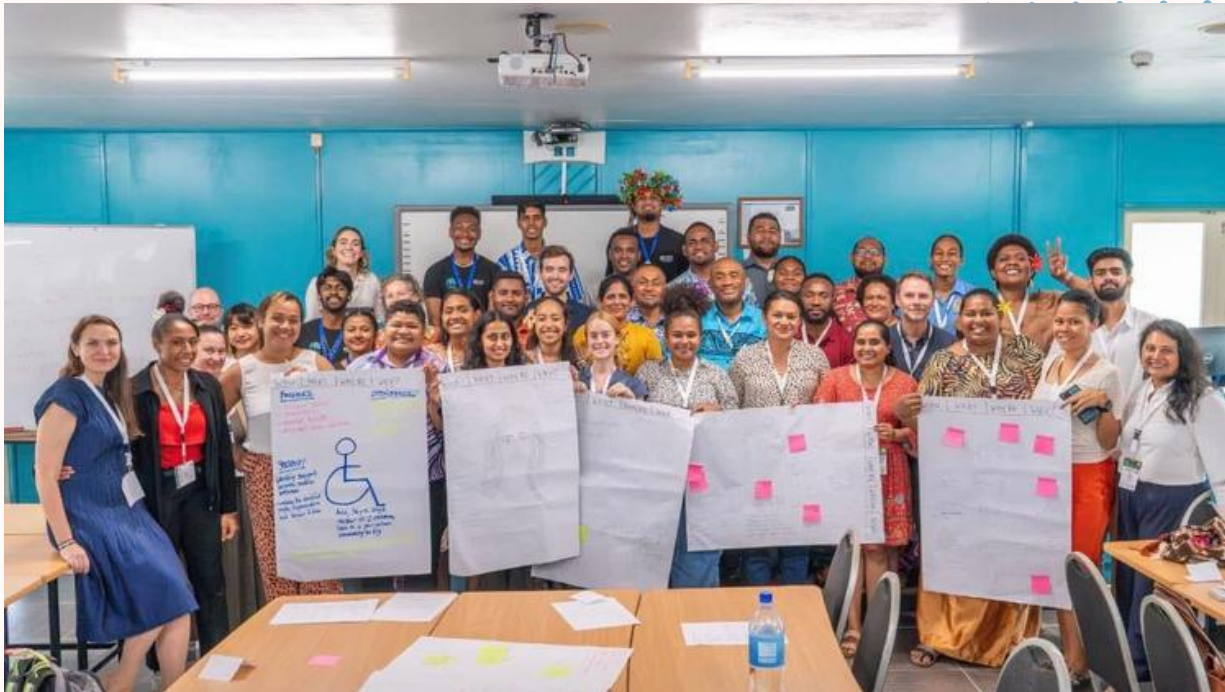
Policy Paper Series Contribution: Advancing Disability-Inclusive Climate Adaptation and Policy: Case Studies from Fiji, Bali, and Indonesia

In 2023, the Canadian Government's International Development Research Centre (IDRC) contracted the Academy to deliver on behalf of the Association of Asian Social Science Research Councils (AASSREC) a research capacity building program in the Indo-Pacific region. The goals of this program, Boosting Social Sciences and their Contribution to Better Lives across the Indo-Pacific , were ambitious—to map research systems and capacity, to establish long-term regional collaboration, and to support vital social science research initiatives, all within the Indo-Pacific region and in particular, low- and middle- income countries (LMICs). At its core, the objective of the program was to strengthen the role of ‘home grown’ social science in improving lives.