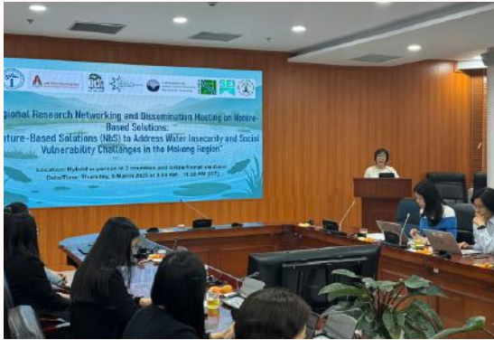
Priority Research Grant project with a team of researchers from Vietnam, Thailand and Cambodia.

The program's two flagship grant schemes – the Priority Social Science Research Grants and the International Social Science Collaboration and Development Grants – attracted strong interest. Respectively, these schemes funded six projects each awarded about $50,000 AUD, and eighteen projects each awarded about $6,000 AUD, decided through a highly competitive selection process by a review committee of leading social science experts from around the region. Both schemes featured multinational and gender-diverse research teams: most applications and awarded projects were led by women, and all included leadership and participation of researchers from LMICs. Together, the schemes established connections and lay the groundwork for future regional research collaboration – notably, 86% of survey respondents who participated in the program reported increased collaboration with other researchers in the region, saying they expect to maintain those connections in the future.