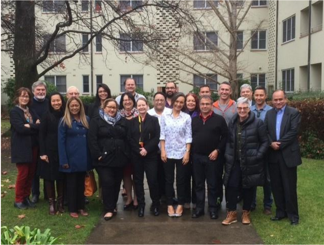
Attendees at the 'Data sovereignty for Indigenous Peoples: Current practice and future needs' workshop in Canberra in 2015.