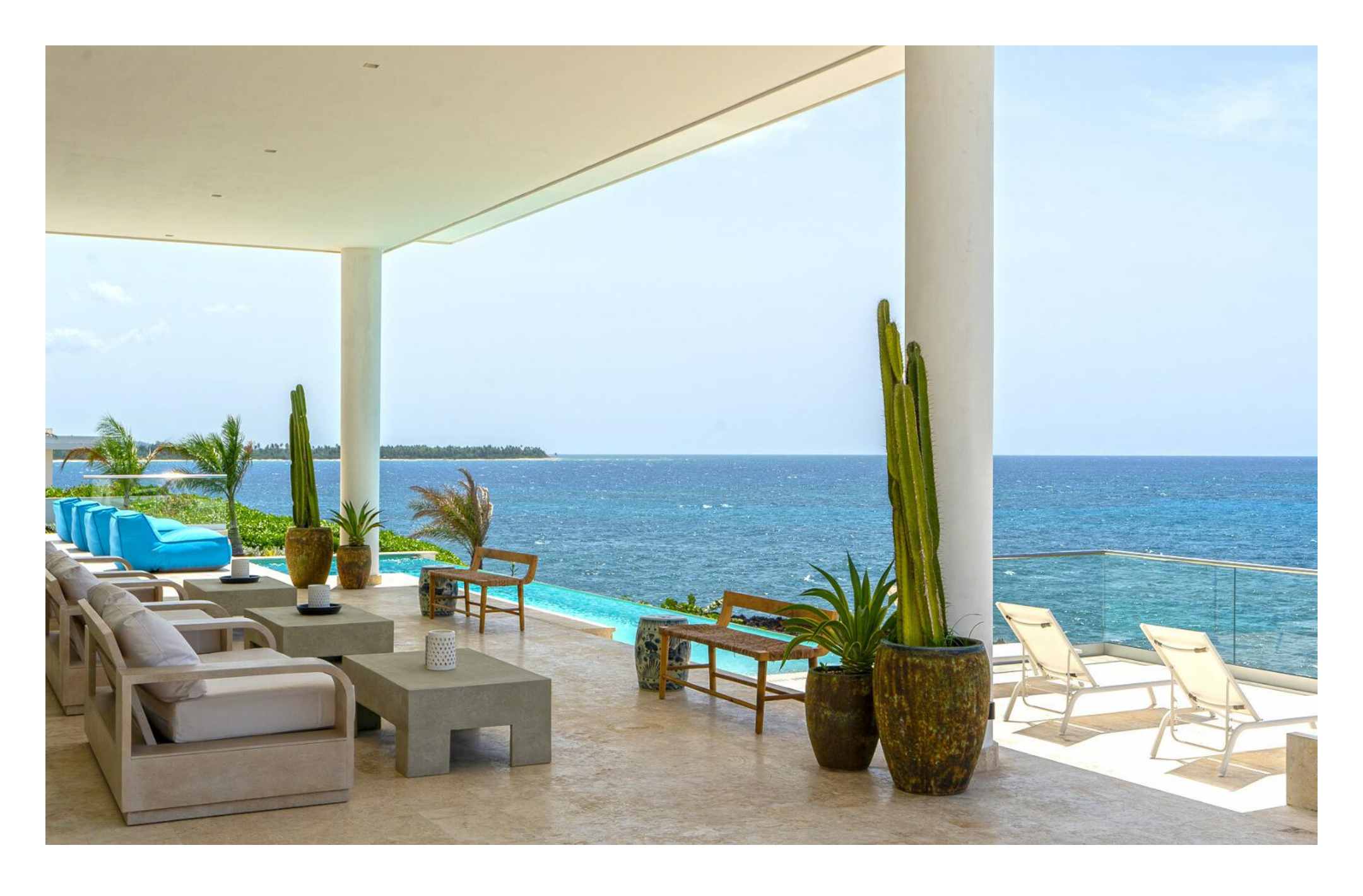
Breathtaking ocean views in your own exclusive oasis!