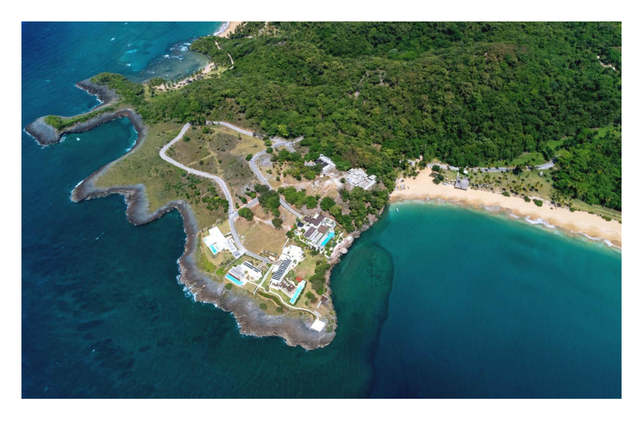
Aerial view of Cap El Limon, one of the most exclusive communities in the Samaná Peninsula