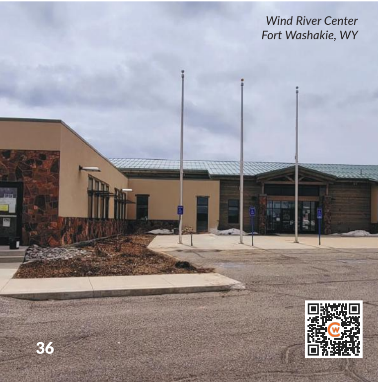
Wind River Center Fort Washakie, WY