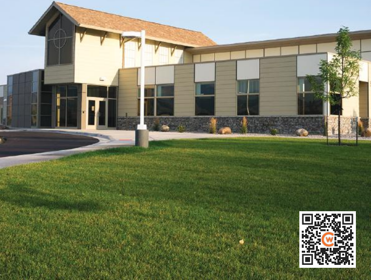
Lander Center Lander, WY