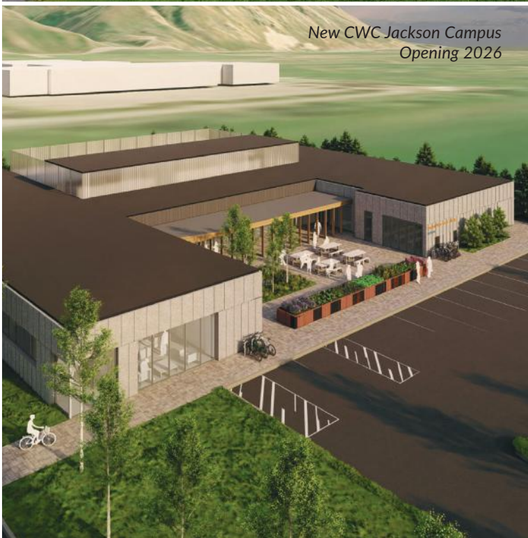
New CWC Jackson Campus Opening 2026

302 W Ramshorn, Dubois, WY 82513 (307) 455-2625 www.cwc.edu/dubois