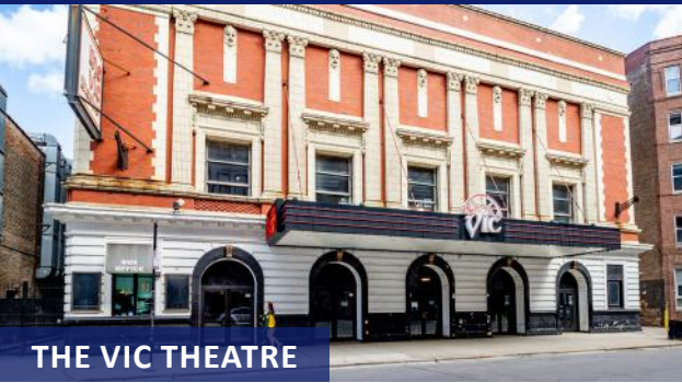
THE VIC THEATRE