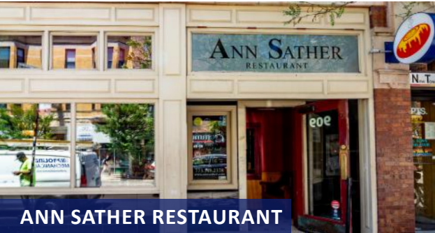
ANN SATHER RESTAURANT