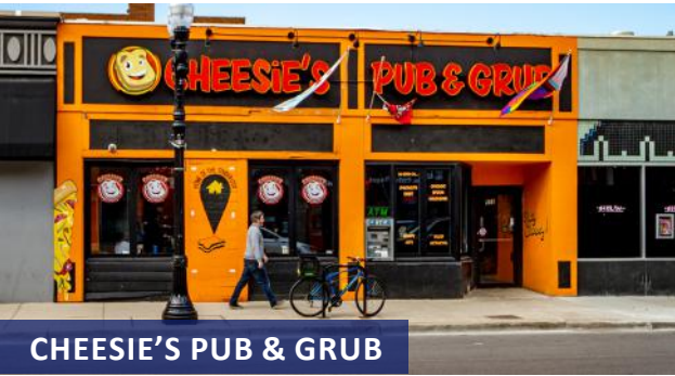
CHEESIE'S PUB & GRUB