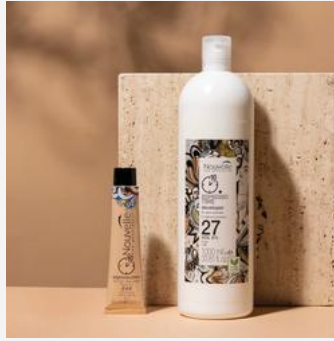
ESPRESSO TIME 10 MINUTE COLOR

Animated by the culture of design, fashion, advanced cosmetic research and a creative attitude to the world of art, Nouvelle satisfies every client's dream. Complete ranges of colors, styling and treatments for an amazing customer experience both in the salon and at home.