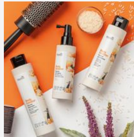
BODY BOOSTER VOLUME + BODY