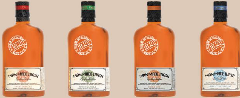
Sweet Tobacco Spiced Vanilla Noble Dud Absolute Mahogany

Save 20% - In Plain Sight - Save 20% on any 18oz Man Made Wash