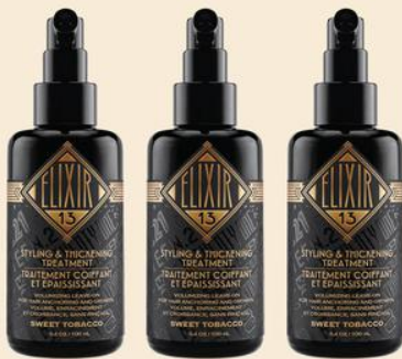
3 x Elixir 13

Buy 2, Get 1 Free - Thick as Thieves - Buy 2 Elixir 13 and Get 1 Free