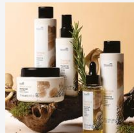
GENIUS REPAIR REVIVE + REPAIR