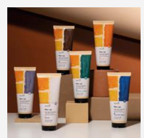
REV UP COLOR MASKS

Contact us to explore introductory offers!