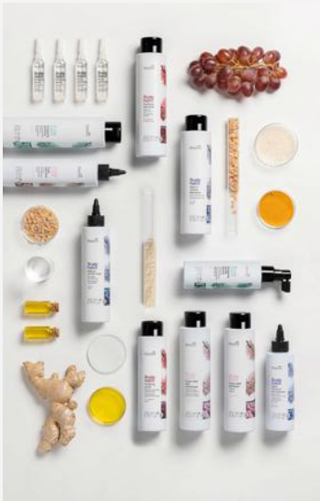
SCALP HABIT HEALTHY HAIR BEGINS AT THE SCALP