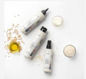
EVERYDAY YOU DAILY HYDRATION