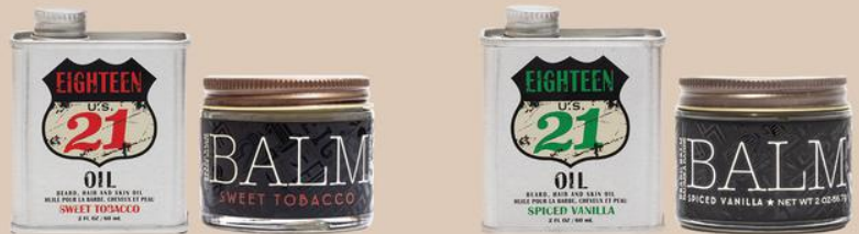
Sweet Tobacco Oil Sweet Tobacco Balm Spiced Vanilla Oil Spiced Vanilla Balm

Choose From Sweet Tobacco or Spiced Vanilla