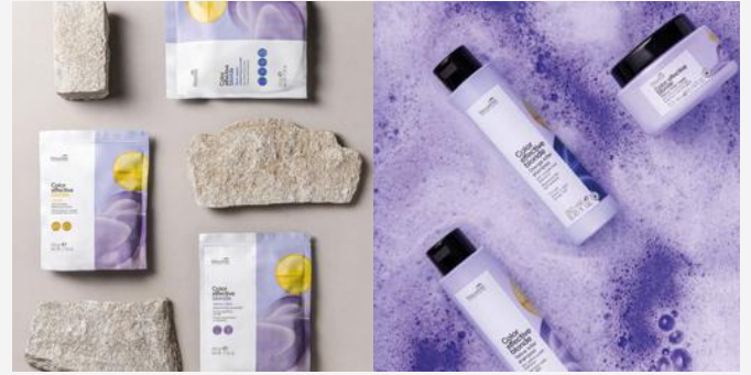
COLOR EFFECTIVE BLONDE TOTAL BLONDE CARE