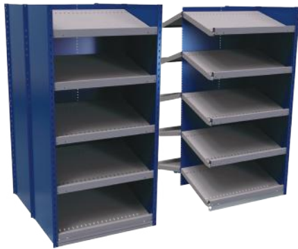
SRE2T-EE751001B Starter unit