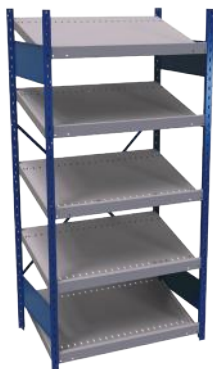
SRE1T-EE750501 Starter unit