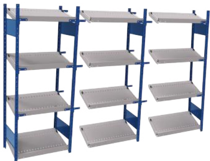
SRE1F-DC75041 Starter unit SRB1F-DC750401 Add-on unit SRG1F-DC750401 End unit