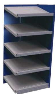
SRB2T-EE750501 Add-on unit