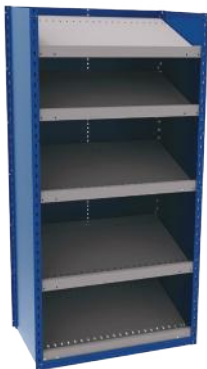
SRE2T-EE750501 Starter unit