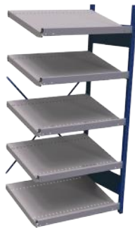
SRB1T-EE750501 Add-on unit