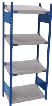
SRK1F-DC750401 Standalone Unit