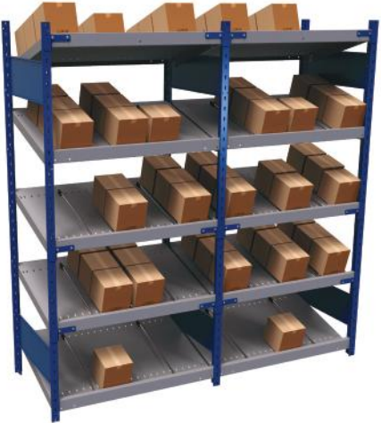
SRE1F-EE750501 + SRG1F-EE750501

Rousseau shelving with sloped shelves provides superior-quality gravity flow storage that integrates perfectly with other products in our Spider® range. This unique product on the market is available in a wide range of dimensions to fulfill your exact requirements. With an average slope of 15 degrees, sloped shelves are perfect for rear-loading applications (flow rack). These units help to create a "first in, first out" (FIFO) system. Shelving units without rear access are also available for more conventional storage. Sloped shelves provide optimum visibility for items stored on shelves above the user's eye level. For shelves below this level, the extra angle reduces visibility of the shelf contents. If visibility is more important than flow in your system, we recommend installing lower shelves at right angles (SH20 / 21).