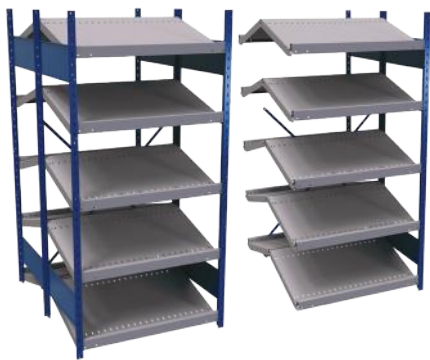
SRE1T-EE751001B Starter unit