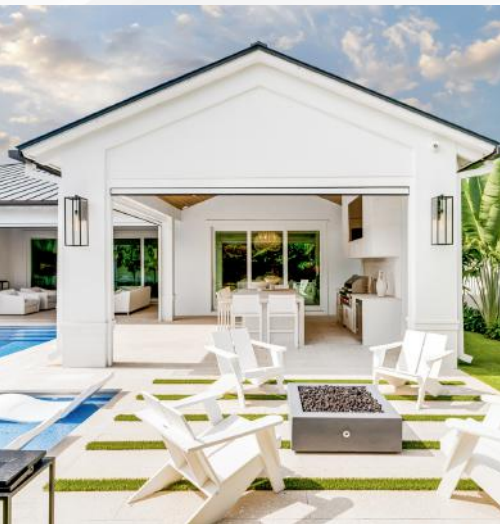
2NW 17 STREET