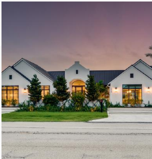
1634 NORTH SWINTON AVE