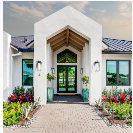
6NW 17 STREET