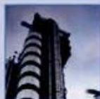
Shops and Offices