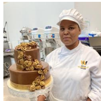
Comfort Komape Bakery