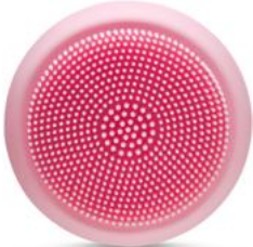
Interchangeable silicone head for the Garrett Beauty Clean Pro