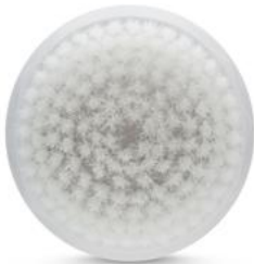
Interchangeable head with bristles for the Garrett Beauty Clean Pro

At Garrett Electronics, we make sure that our products can be used for as long as possible. Do you need additional filters or a head for your sonic facial cleansing brush? Check out our list of accessories!