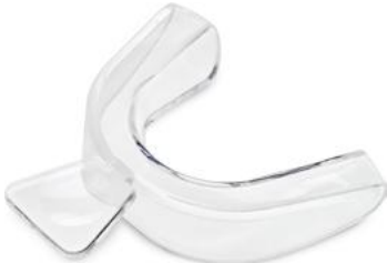
Silicone mouthpiece for the Garrett Beauty Smile Lite