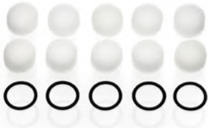
Replaceable filters and seals for the Garrett Beauty Pure Skin