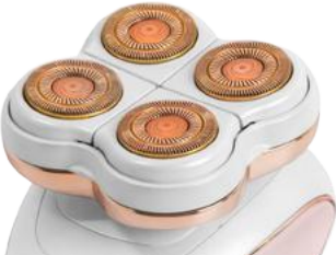
Replaceable blades for the Garrett Beauty Shine