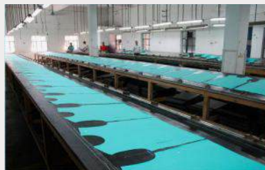
Printing on Cut Pcs