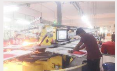
Photo Printing (Cut Pcs)