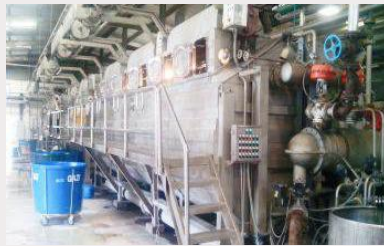
Dyeing (Fabric Colouring)