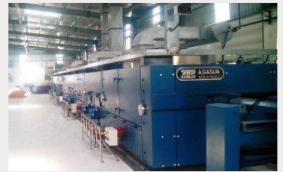
Dyeing (Fabric Finishing)