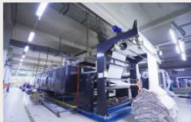
Fabric-All Over Print (Finishing)