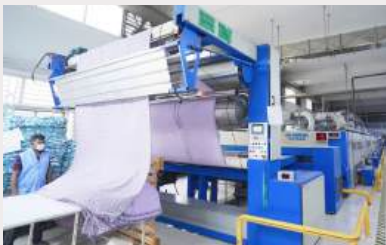
Fabric-All Over Printing