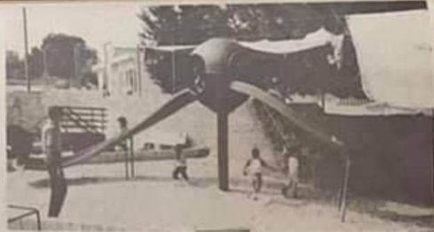
جانب من الألعاب