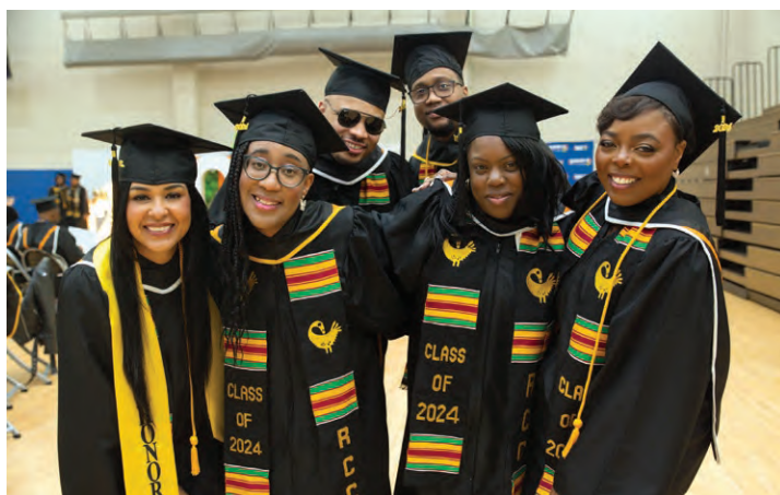
Class of 2024 graduates pose for a photo before the ceremony begins.