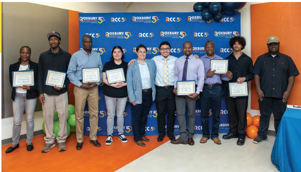
The inaugural SBT class poses alongside RCC staff at the completion ceremony.

READY TO ENROLL OR WANT TO LEARN MORE? Contact the Center for Smart Building Technology at (857) 701-1541 or visit rcc.mass.edu/sbt .