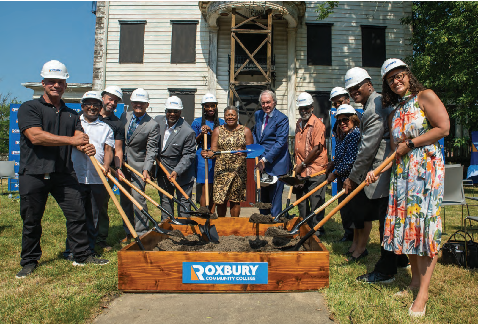
RCC supporters, leaders, and elected officials pose for a photo to celebrate the start of renovations.