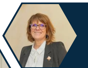
MANON JEANNOTTE LIEUTENANT GOVERNOR OF QUEBEC