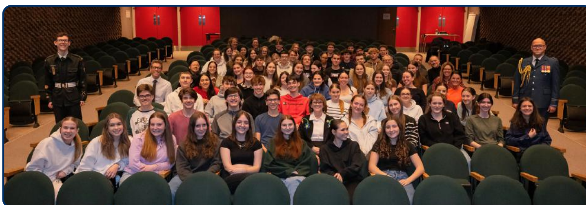
Visiting of La Courville High School, February 14, 2025