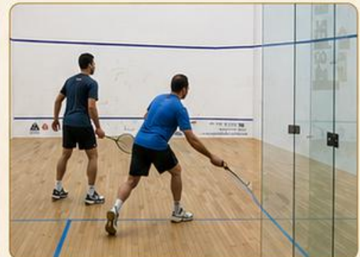
Focus. Fitness. Commitment.

PLENTY TO PLAY FOR BEFORE THE JULY PAUSE. | Go Victoria!