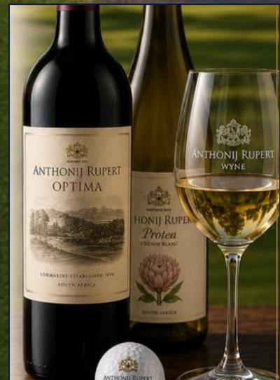
COMPLIMENTARY ANTHONIJ RUPERT WINE TASTING