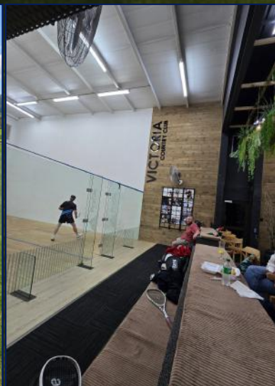
WINTER LEAGUE REACHES HALFWAY