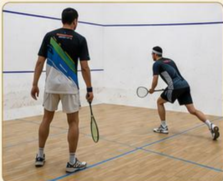
Determination on every point.

CLUB SPIRIT Competitive, Vibrant & Growing