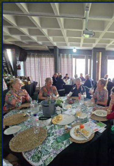
LADIES OPEN SUCCESS