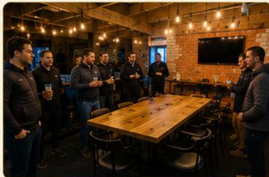
Great games. Great mates. Great club.