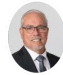
J. Parker Curney Mech. Ltd. London