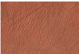
Figure 8. Smoothnesses