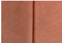
Figure 6. Differences in tone