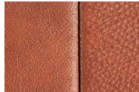
Figure 7. Grain differences