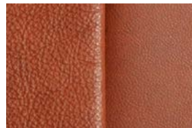
Figure 10. Real vs. Artificial