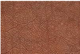
Figure 5. Wrinkles