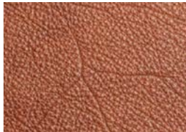
Figure 3. Blood vessels