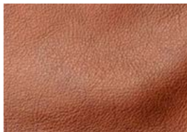
Figure 9. Stretching