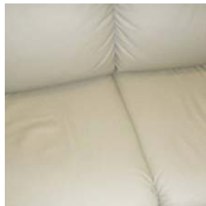
Figure 1. Seat Indentations