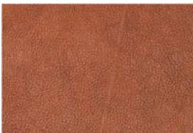
Figure 2. Healed scars