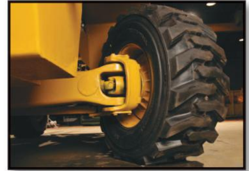
STEERING CONTROL: Designed for durability with an extreme duty sandwich type axle. Single cylinder with 4 inch diameter rod, and heavy duty spindles.