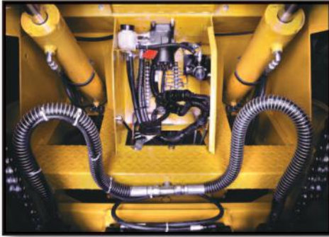
ELECTRICAL PANEL: Electrical system maintenance is easy through a hinged weather tight compartment located on the front of the unit between the forks.