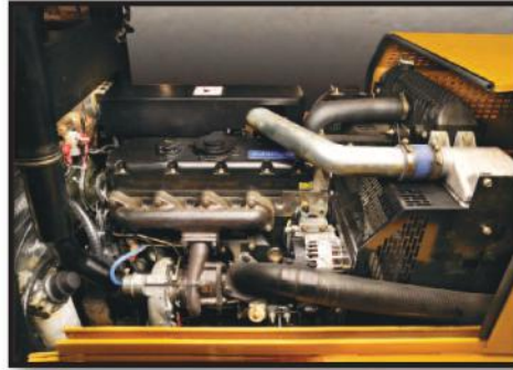
ENGINE: The M Series forklifts have a sliding hood for easy access during maintenance, and house a Perkins Turbo Tier 3 emissions compliant diesel engine.