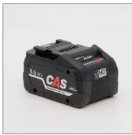
CAS Battery 2) LiHD 18 V, 5.5 Ah ZU-600