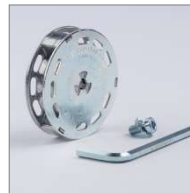
MONTI Adaptor System 11mm AS-012