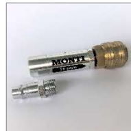
MONTI Air Pressure Regulator for 11mm belts (reduction to 5,2 bar) incl. coupling and nipple ZU-070