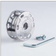
MONTI Adaptor System 23mm AS-009