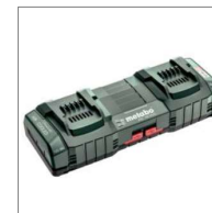
Quick Charger DUO, air-cooled 2) for charging 2 CAS LiPower/LiHD batteries of 12-36 V mains voltage 220-240 V ZU-603

1) Shipment of Lithium-ion batteries is subject to "Dangerous Goods Transport Regulations". Therefore, the transport options, especially by AIR, are limited. Additional charges will apply for preparation of transport documents (ADR / Shipper's Declaration for Dangerous Goods).