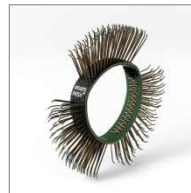
MBX® belt, steel, coarse, black, 11 mm 10pack MB-020-10 5pack MB-020-05