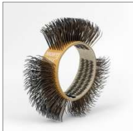
MBX® belt, steel, medium, ochre, 23 mm 10pack MB-009-10 5pack MB-009-05