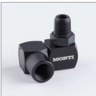
MONTI 360° Swivel Connector, Rp 1/4", for pneumatic drive units ZU-073