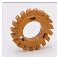
Vinyl Zapper® wheels working width ca. 15 mm 1 piece ZU-012