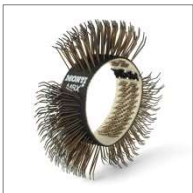
MBX® belt, steel, coarse, black, 23 mm 10pack MB-001-10 5pack MB-001-05