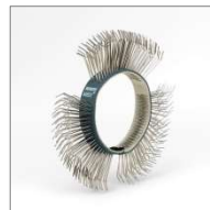
MBX® belt, stainless steel, coarse, blue, 11 mm 10pack MB-030-10 5pack MB-030-05