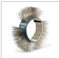
MBX® belt, stainless steel, fine, blue, 23 mm 10pack MB-007-10 5pack MB-007-05