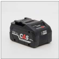
CAS Battery 2) LiHD 18 V, 8.0 Ah ZU-602