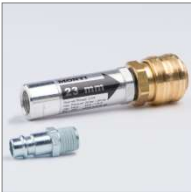
MONTI Air Pressure Regulator for 23mm belts (reduction to 6,2 bar) incl. coupling and nipple ZU-071