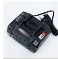
Quick Charger, air-cooled 2) for charging CAS LiPower/LiHD batteries of 12-36 V mains voltage 220-240 V ZU-601