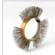
MBX® belt, steel, medium, ochre, 11 mm 10pack MB-021-10 5pack MB-021-05