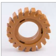
Vinyl Zapper® wheels working width ca. 30 mm 5 pieces ZU-010-05 1 piece ZU-010-01