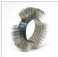
MBX® belt, stainless steel, coarse, blue, 23 mm 10pack MB-011-10 5pack MB-011-05