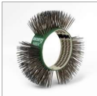
MBX® belt, steel, fine, green, 23 mm 10pack MB-005-10 5pack MB-005-05