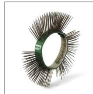
MBX® belt, steel, fine, green, 11 mm 10pack MB-028-10 5pack MB-028-05