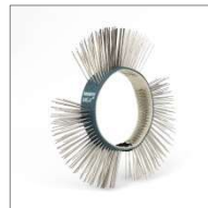
MBX® belt, stainless steel, fine, blue, 11 mm 10pack MB-031-10 5pack MB-031-05