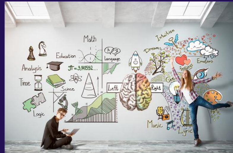
Collaboration with partners and our trusted business community

Whatever you need, we aim to deliver ourselves or collaborate with partners and our trusted business community.