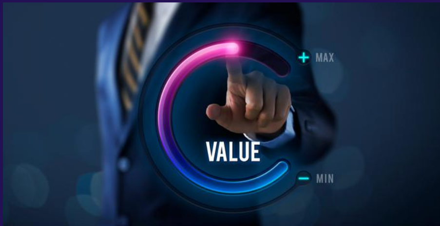
Value / Price Ratio