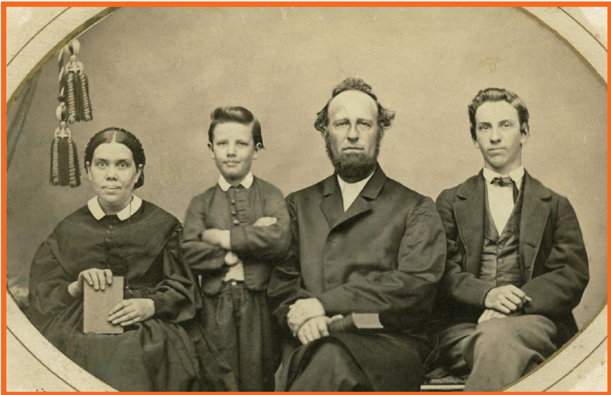
White Family

We encourage everyone to read and enjoy these brief readings in the bulletin and on the bulletin board.