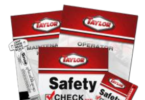
Vehicle Information Package "VIP" (Standard)