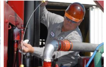
Easily Accessible Daily Checks