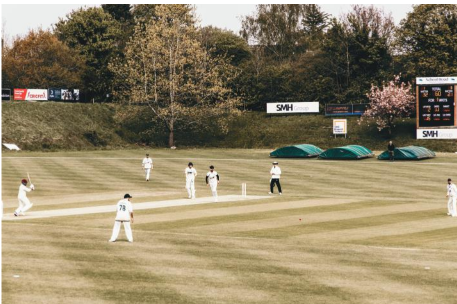
Premier Division: Sheffield Collegiate batting at home to Shiregreen.