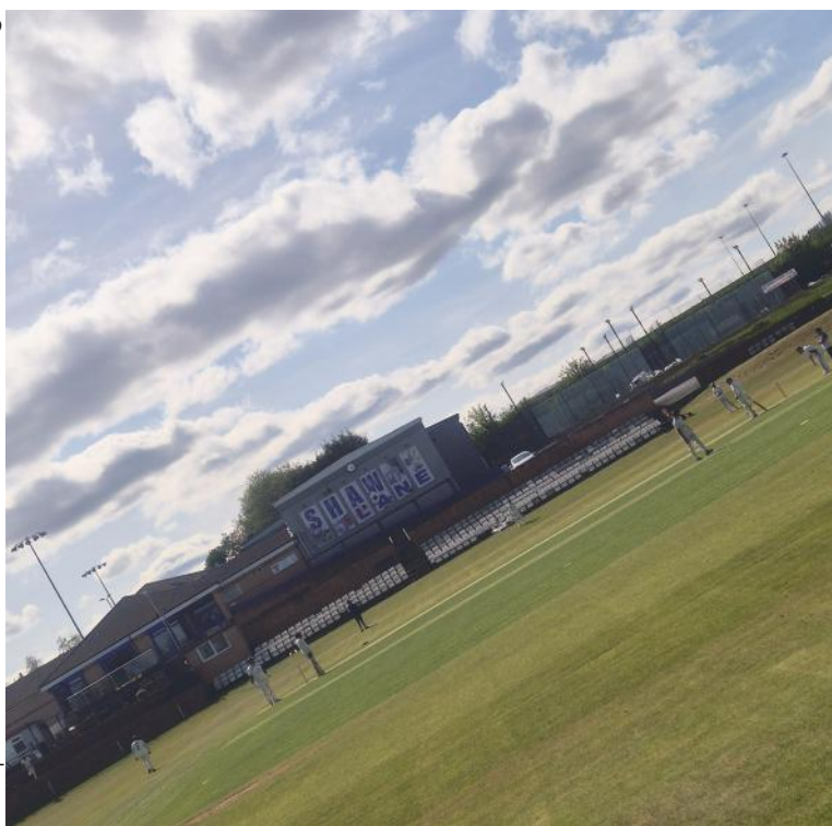
Abbeydale batting as they powered to victory over Attock

Shahrukh K was the standout performer with a brilliant 107 runs off