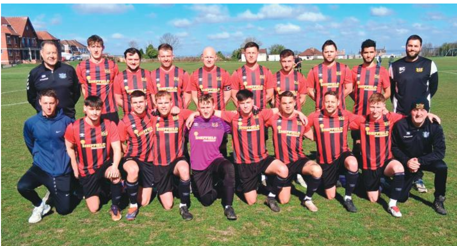
CBC Premier Division Runners Up Stannington Village