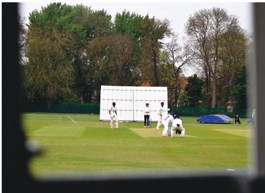
Division One: Darfield batting in their game at Warmsworth