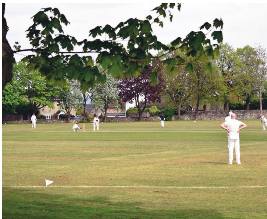
Division Six: Mexborough batting in their game at Wadsworth