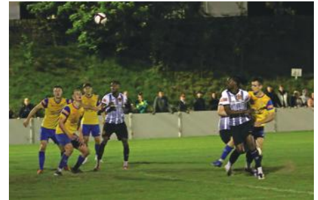
Stocksbridge came under heavy second half pressure.