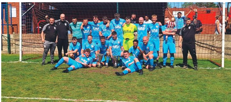
Above: Birley FC winners of the Imperial Sunday League Cup.