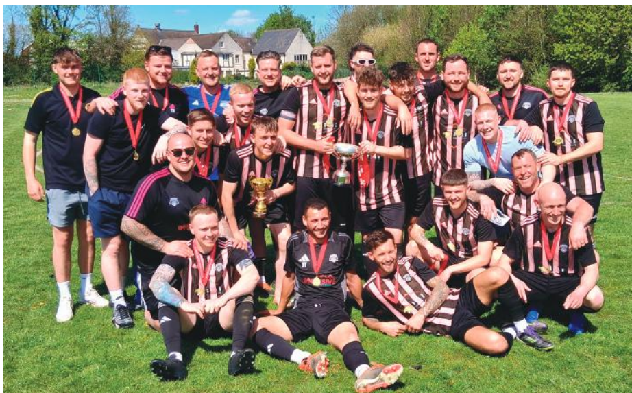
Division 2 champions Loca FC with their winning cup and medals