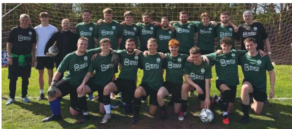
Below: Beaten finalists, Stannington Rangers