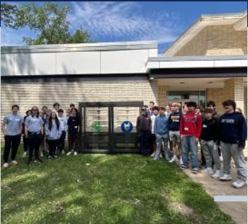
The projects include mini golf courses for the Glencoe Library and a greenhouse for Wilmette Junior HS.