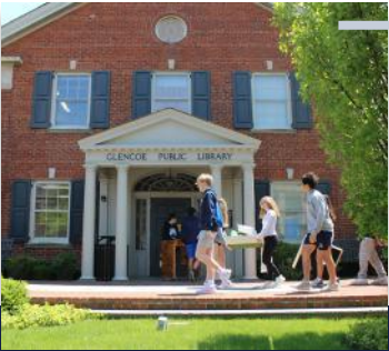
Geometry, Design and Construction classes deliver their "community build" projects.

The Future Programming Research and Development Committee plans to present its recommendations to the Board of Education this spring.