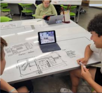
Urban Design and Civic Engagement students work on redesign proposals for a Wilmette apartment complex.