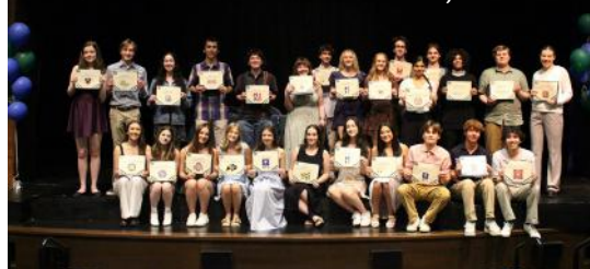
FINE & PERFORMING ARTS SIGNING DAY, MAY 2024

Signing days are just one of the many ways New Trier recognizes the accomplishments of its amazing students each year.