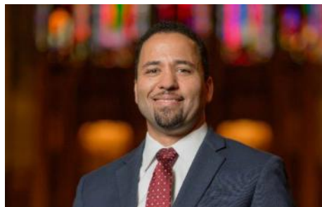
Sponsored, in part, by the Butterfield-Thomas Endowment and by your generous contributions to the Worship program.

Prior to his appointment at Duke, he served as the Perry and Georgia Engle Assistant Professor of Homiletics at Princeton Theological Seminary. He received his Bachelor of Arts in music with a concentration in vocal performance from Stanford University, his Master of Divinity from Princeton Theological Seminary, and his Doctor of Theology from Emmanuel College at the University of Toronto.