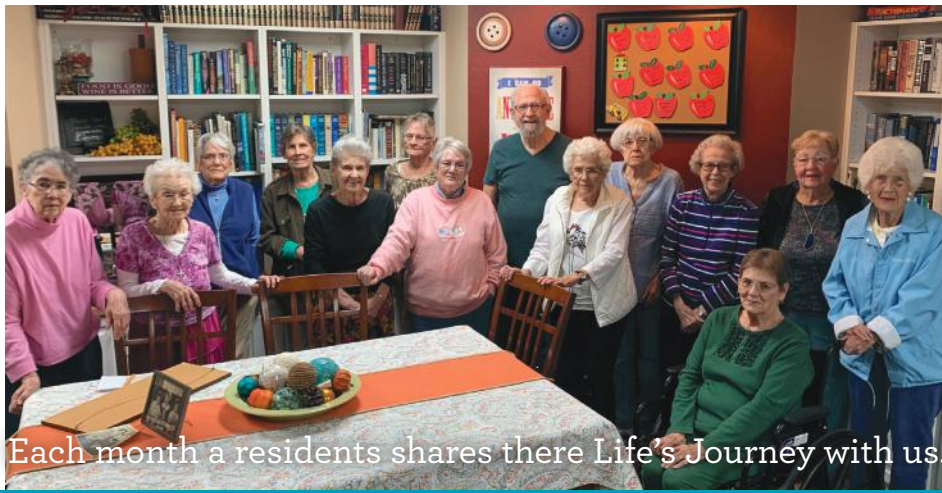
Each month a residents shares there Life's Journey with us.