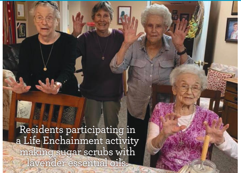
Residents participating in a Life Enchainment activity making sugar scrubs with lavender essential oils.