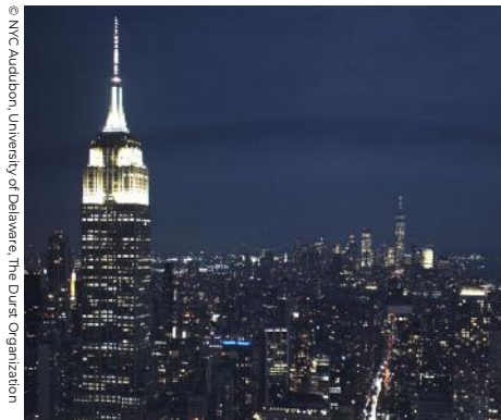
Bright lights fill the NYC skyline at night.

NYC Audubon speaks up for birds and their habitats with advocacy efforts across the city.