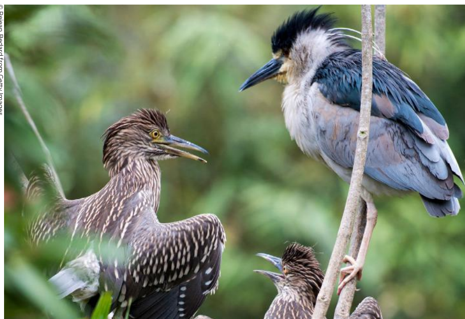
The Black-crowned Night Heron is one of nine long-legged wading bird species we survey each year as part of our Harbor Herons Surveys in New York Harbor.

Our work with building partners makes the City safer for birds, including reducing the 230,000 bird deaths from building collisions that occur annually. We applaud property managers and building owners who have taken voluntary steps to adopt bird-safe glass, including 1 Hotel Brooklyn Bridge and the Port Authority of NY & NJ. Check out our list of bird-friendly buildings at nycaudubon.org/birdsafenyc , and let us know what additional buildings should be recognized for their efforts. ■