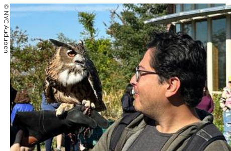
A participant gets up close with "Auggie" the Eurasian-eagle Owl at the 2022 "Raptorama!" Festival.

This fall, NYC Audubon will offer more than 100 bird outings and classes around the City, including many free programs and those that are great for beginners. Join us for planned photowalks in Staten Island, birding by boat in the Bronx, bilingual events, a series of outings tailored for those with physical disabilities, and lots more! Check out our listings at nycaudubon.org/outings .