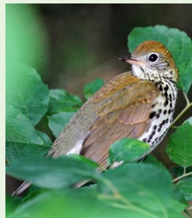
The night-migrating Wood Thrush is a frequent victim of collisions with buildings. Read more on the back cover.