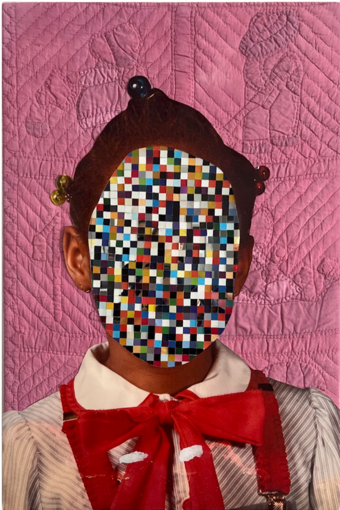
& Jill , Paper, mirror, second hand quilt & spray paint, 24" X 36" ($3,500)