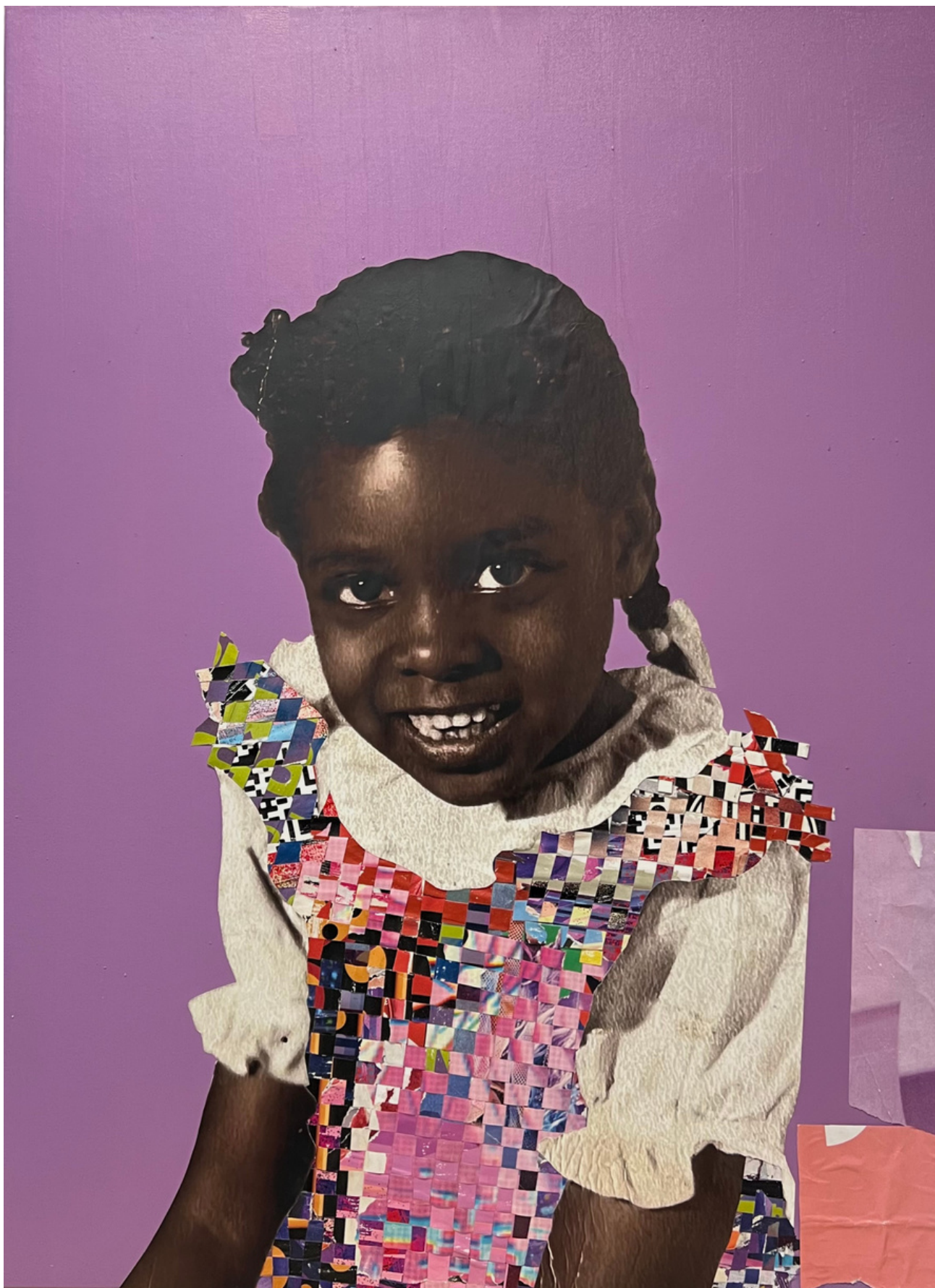
Beverly Weave #3 , Paper, found street poster & acrylic paint, 30" X 40" ($4,000)