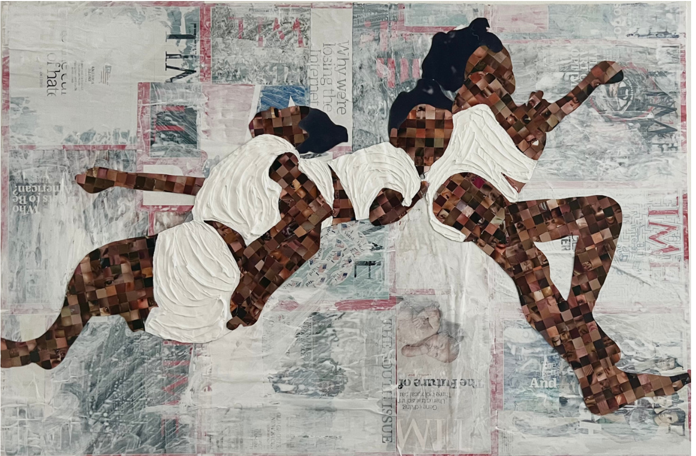
Soft Place to Land? , Paper, second hand quilt & acrylic paint, 23" X 29" ($1,5000)