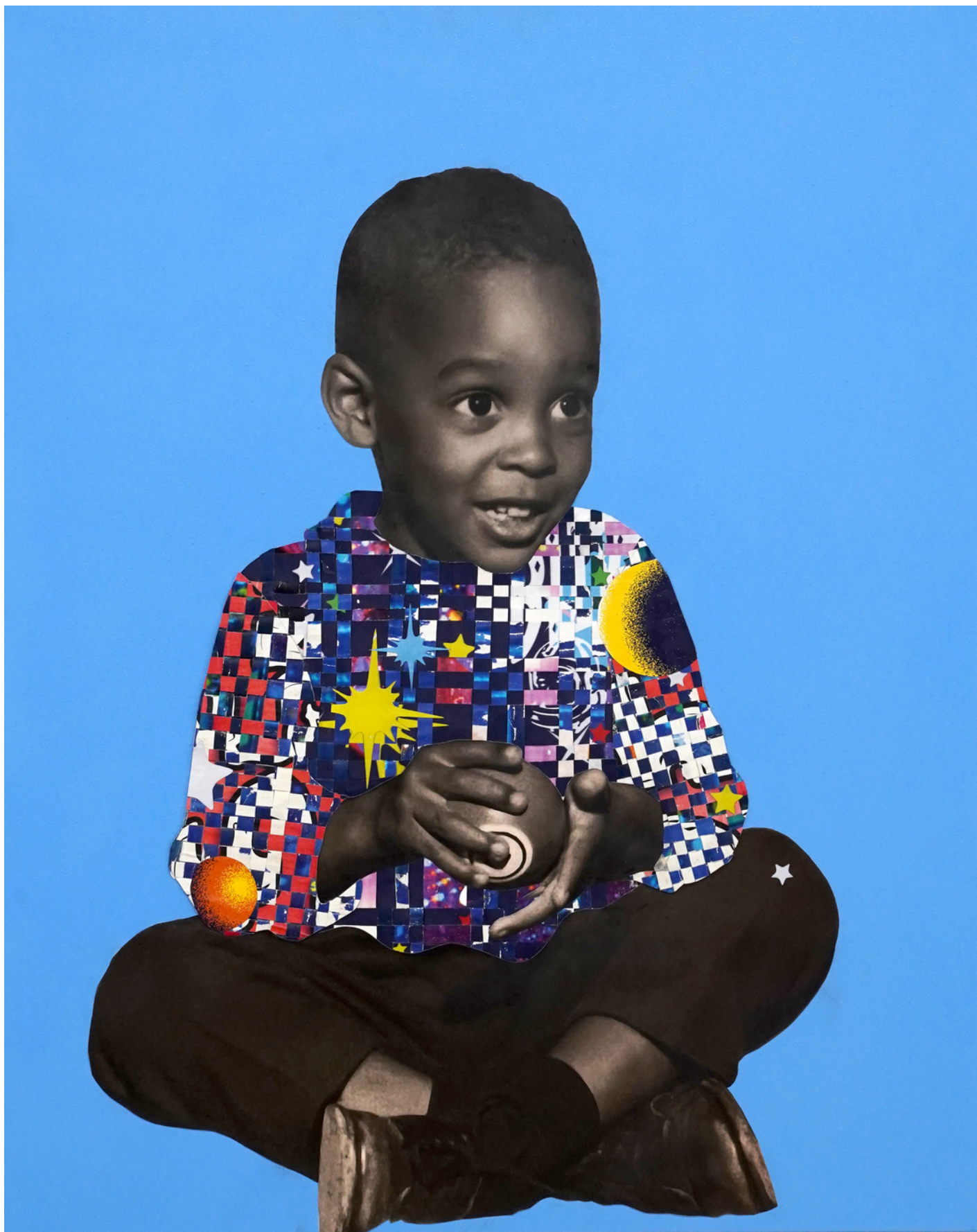
Stevie Portrait #2 , Paper, found street posters & acrylic paint, 24" X 30" ($3,000)