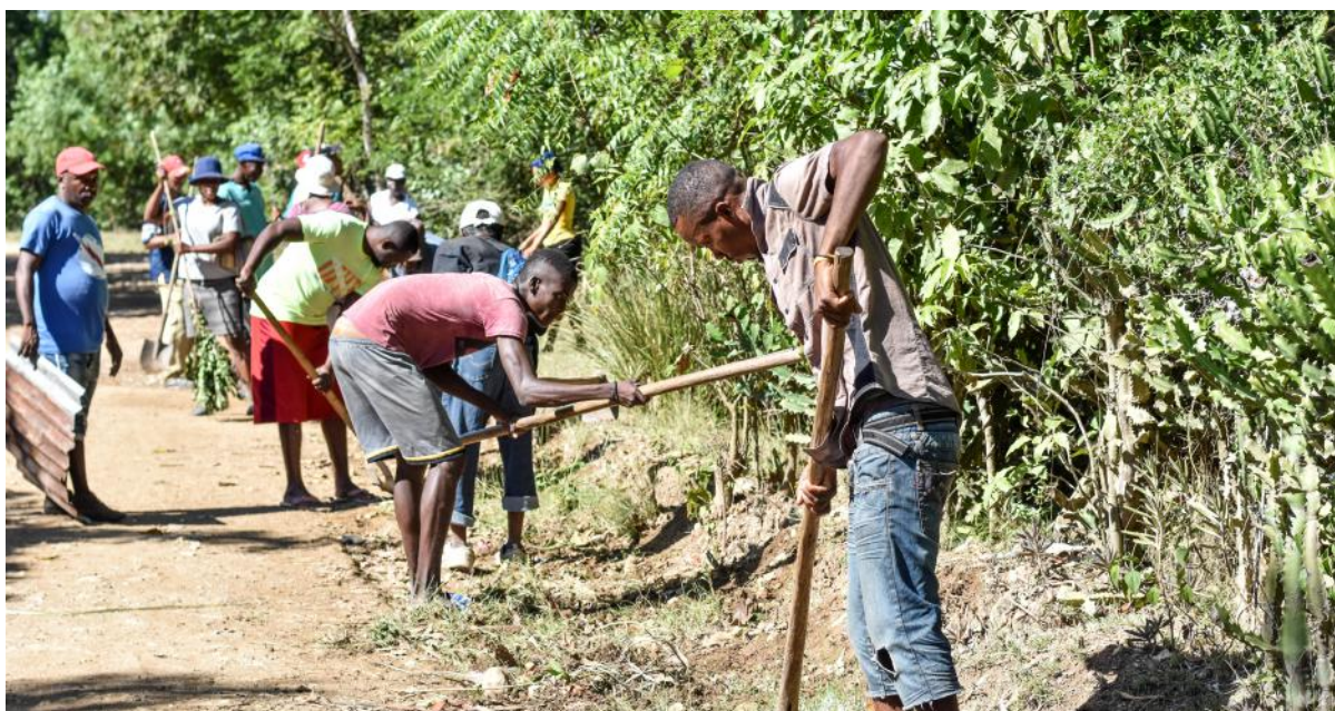
Community Cleaning in Lievre and Toirac