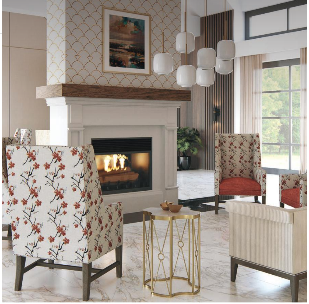
Featuring: Greenbrier Wing Chair, S-7444-01, BenchMade Bench, S-33TF-10, and East Camden Accent Table, 8098-AT.