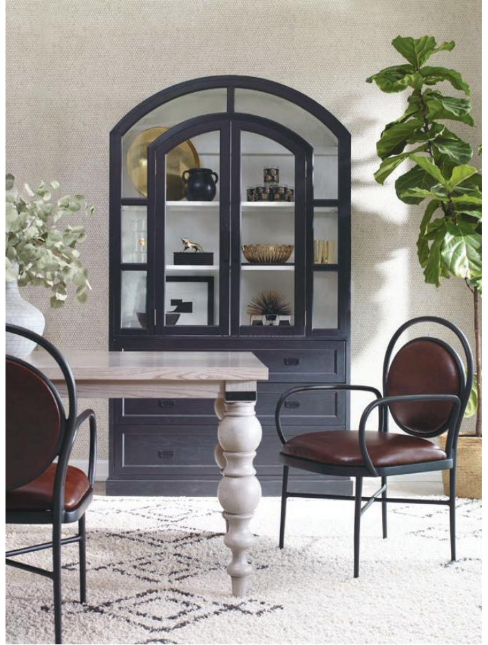
Featuring BD Collection for Fairfield: Warner Leather Dining Chair, F600-04-B, Cooper Dining Table, M201-DT, and Edward Curio Cabinet, 4313-18.