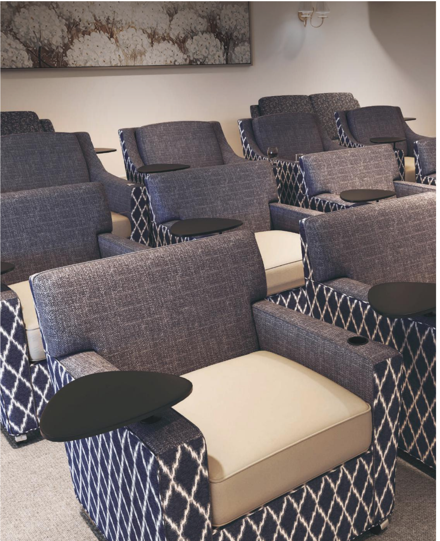
Featuring: Conrad Lounge Chair, S-747C-TH.