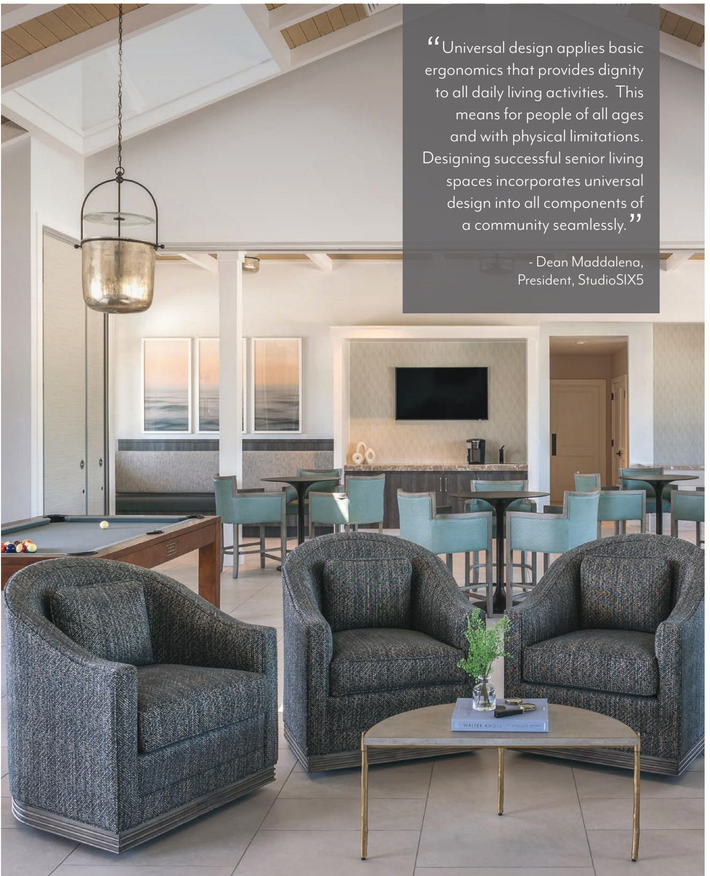
Featuring: Lyon Swivel Chair, 1111-31 and Albany Counter Stool, 8720-C6.