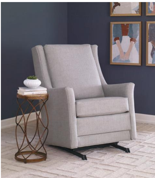
Featuring: Sadie Locking Glide Chair, S-7213-LG.