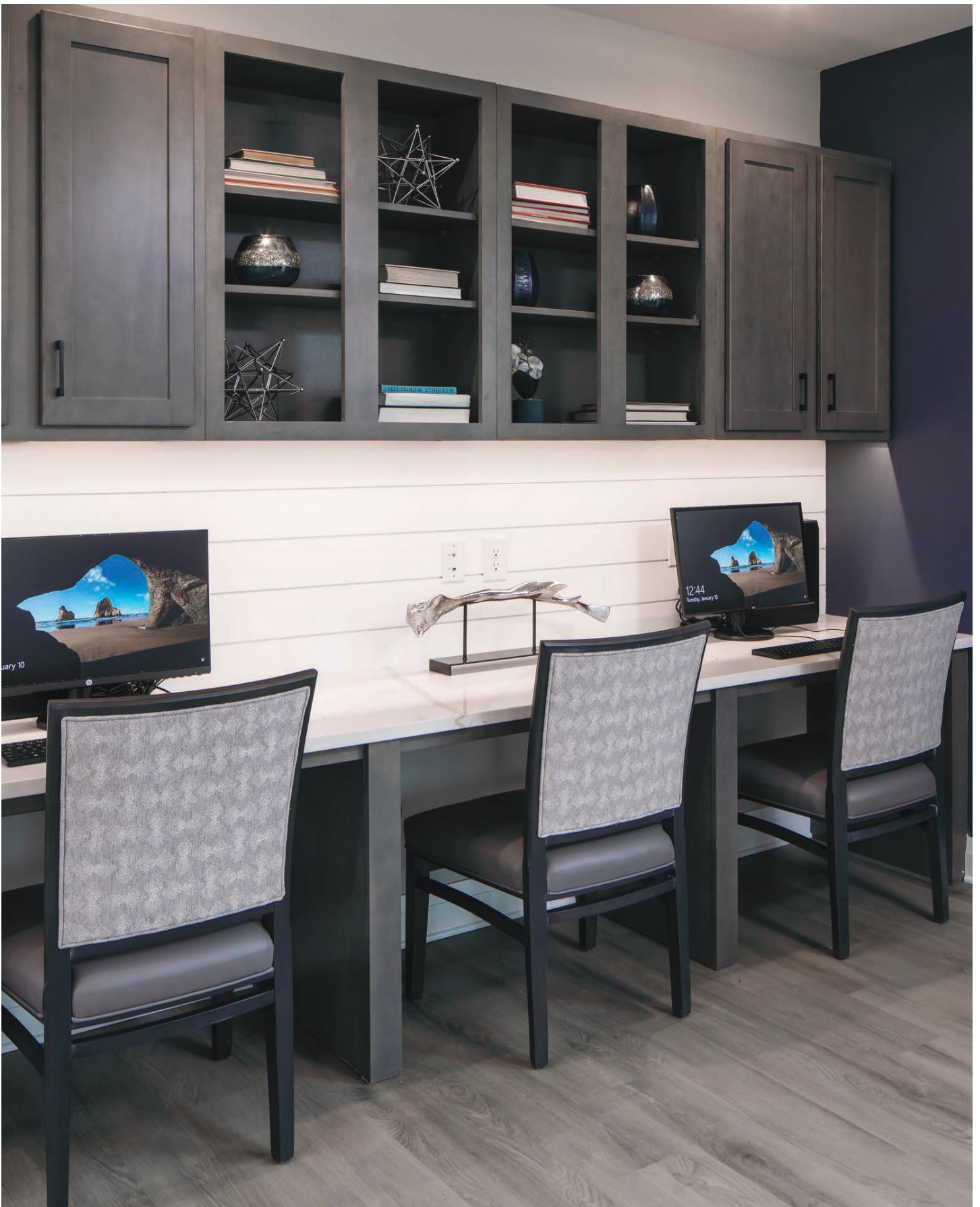
Design Credit: Design East, Medford. Featuring: Plymouth Side Chair, 8411-05.