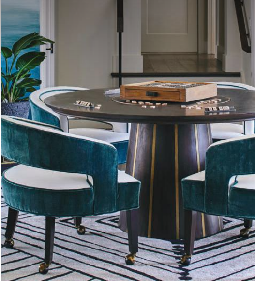
Design Credit: New South Home, Charlotte NC. Featuring: Hayley Arm Chair, 8784-A4.

“A loveseat gives the feel of a sofa but provides at least one arm on each end to aid in getting up. We do use sofas in areas where a resident might like to lie down, like a quiet room in a memory care facility.”