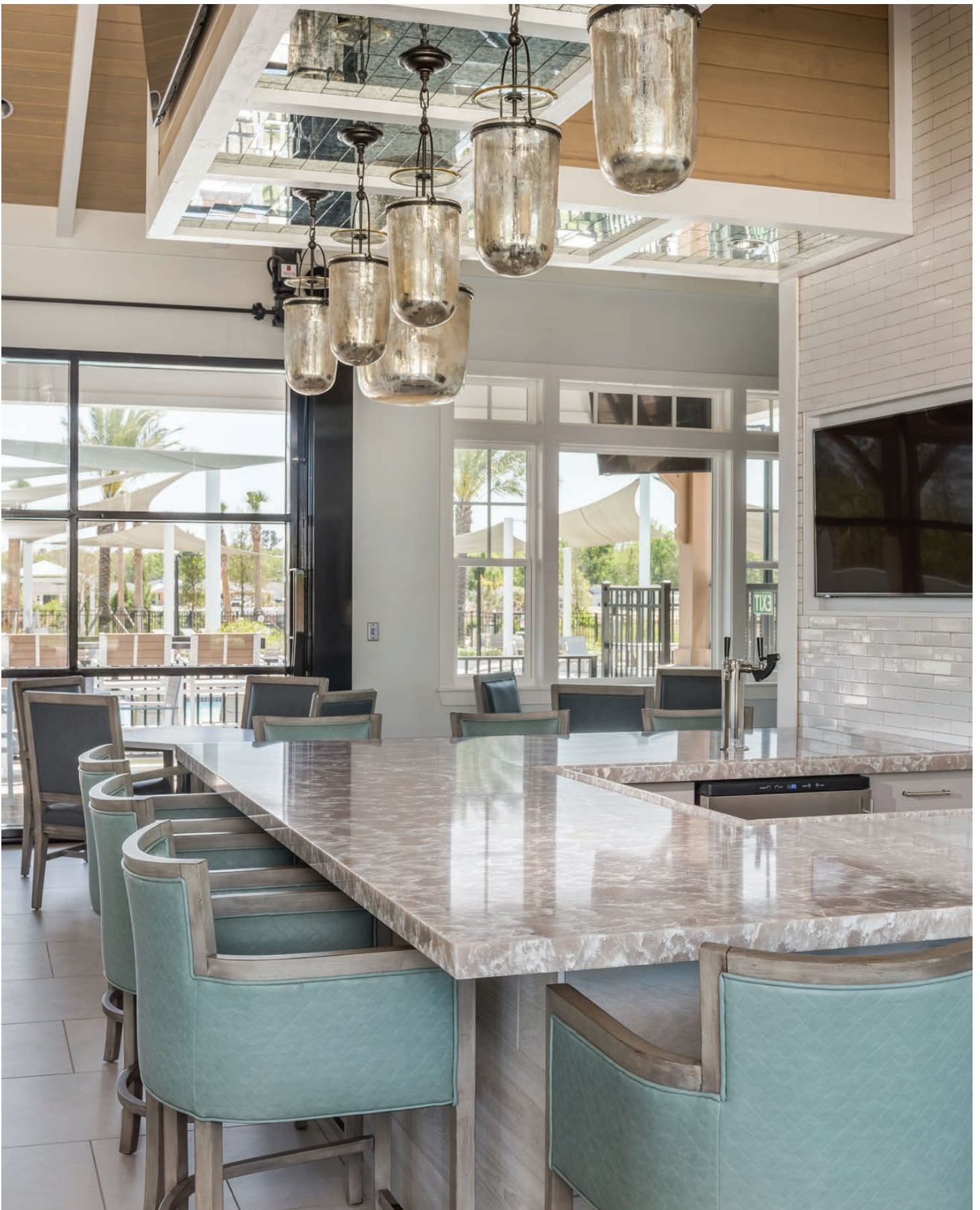
Design Credit: Micamy Design Studio. Featuring: Albany Counter Stool, 8720-C6.