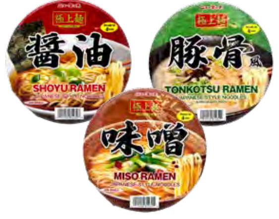
New Touch Goku-jo-men Cup Ramen Shoyu / Miso / Tonkotsu 3.3 oz - 4.4 oz

Higashimaru Tonkotsu Kagoshima Ramen Regular / Spicy 13.7 - 13.8 oz