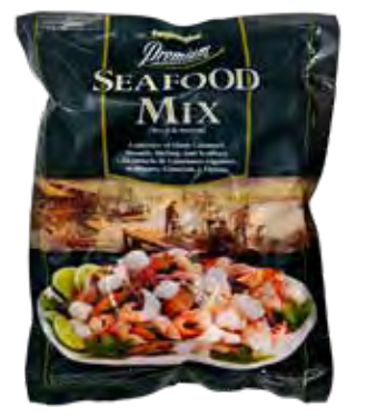
Premium Seafood Mix $6.49/pk