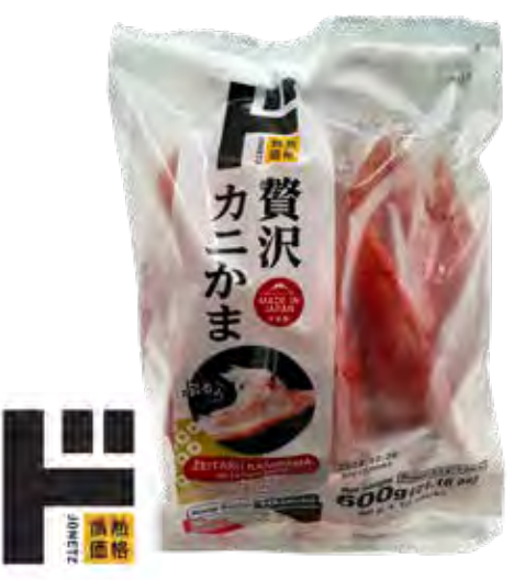
Jonetsu Kakaku Zeitaku Kanikama 21.16 oz <u>9.99</u>