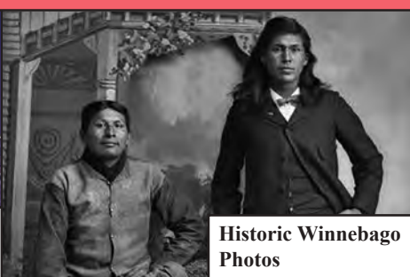
Historic Winnebago Photos