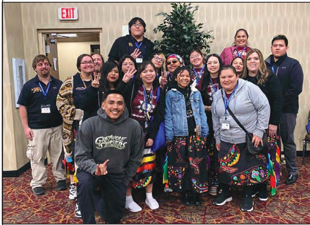
Little Priest Tribal College placed 3 rd in Hand Games at the AIHEC Student Conference! The last game went until 2:00am and lasted almost 3hrs. On day 2 they beat Sinte Gleska University and lost to White Earth and Navajo Technical University. Special Thanks to all of the Tribal Colleges who supported LPTC.