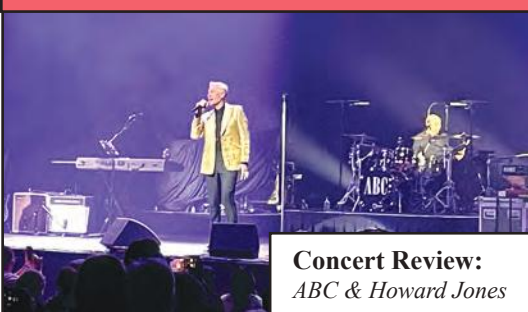
Concert Review: ABC & Howard Jones