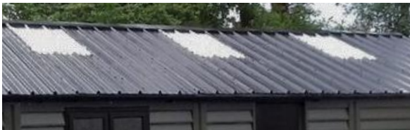
Silver Box profile Roof

Price includes 10pt pedestrian door as standard | Add gutters & downpipes - €200