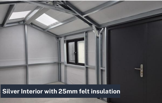
Silver Interior with 25mm felt insulation

Please Note: Felt interior may be a different colour than shown.