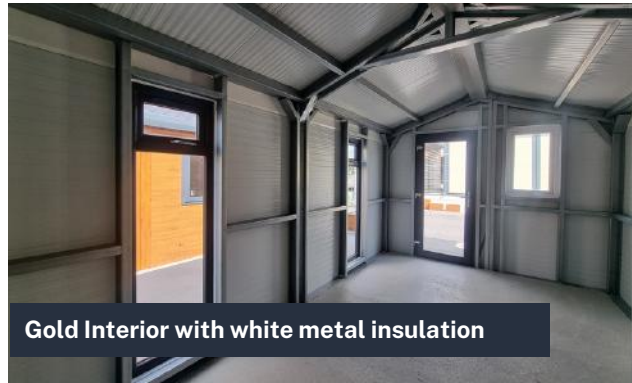
Gold Interior with white metal insulation