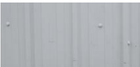
Gold Range Box Profile Roof

ROOF COMES IN ANTHRACITE GREY AS STANDARD