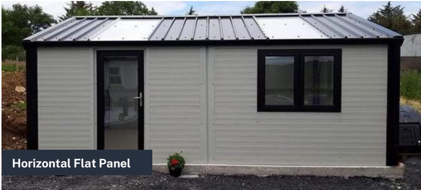
Horizontal Flat Panel

Discover the Gold standard in outdoor storage. Available in two styles, these premium sheds offer excellent thermal performance and a modern design. The Gold Range stands out with its 40mm (minimum) insulation in both the roof and walls, which can be upgraded for even better efficiency. Inside, the panels have a white metal finish that's easy to clean and maintain.