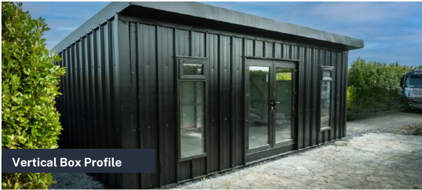
Vertical Box Profile