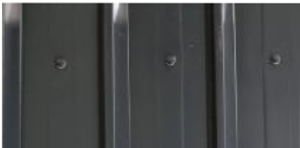
Horizontal Flat Panel Roof

Gold Range price includes door worth €800 , gutters & downpipes as standard.