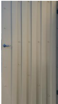
Single Clad Door