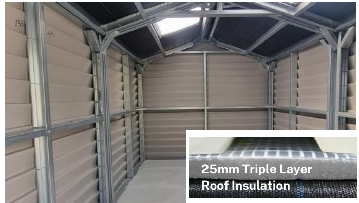
Single Clad Interior shown with clearlights which are included