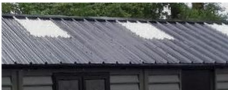
Bronze Box Profile Roof