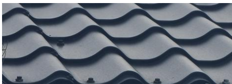
Bronze Tile Effect Roof - Optional Extra