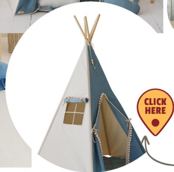
Jeans Teeppee Tent