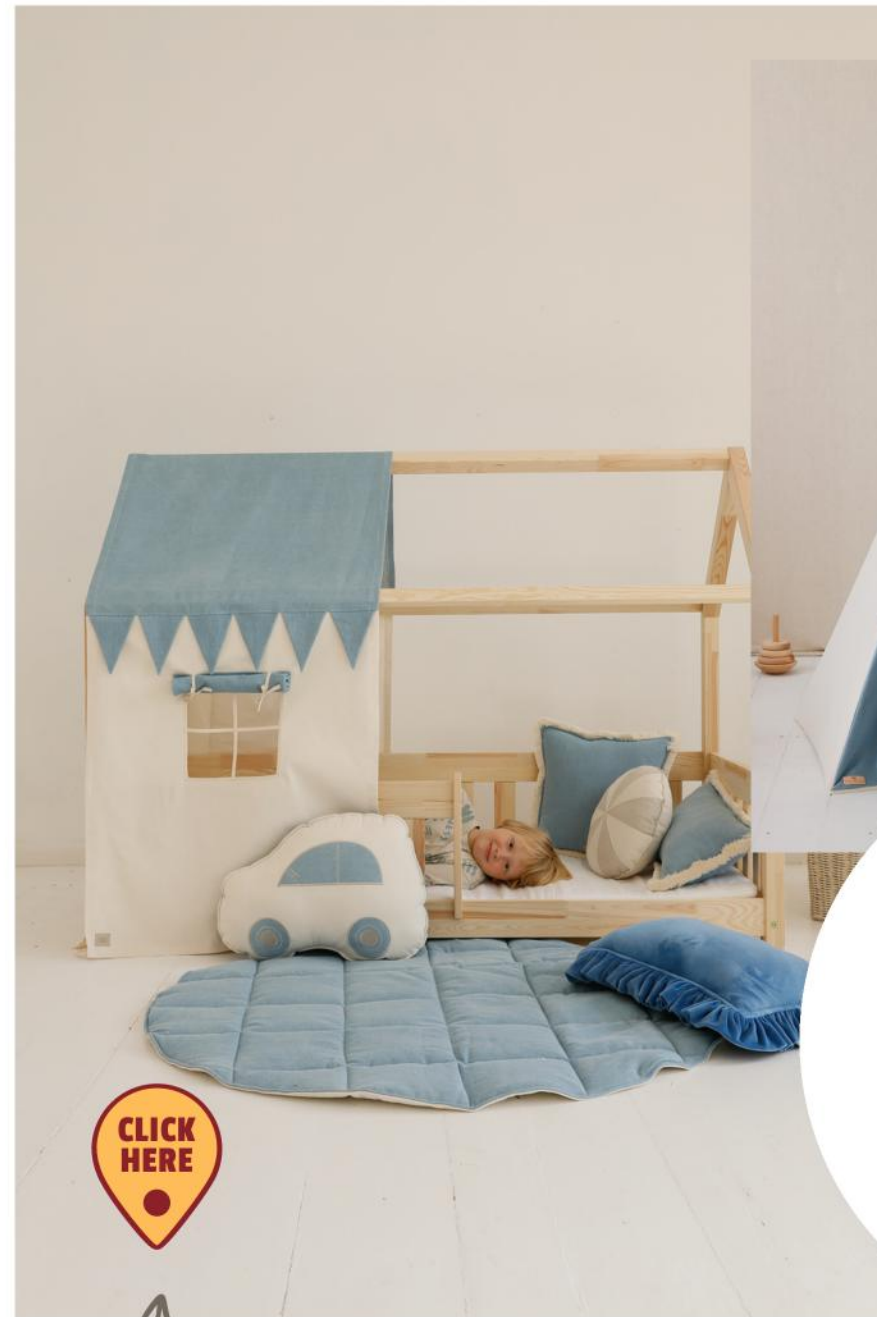
Blue Jeans bed canopy