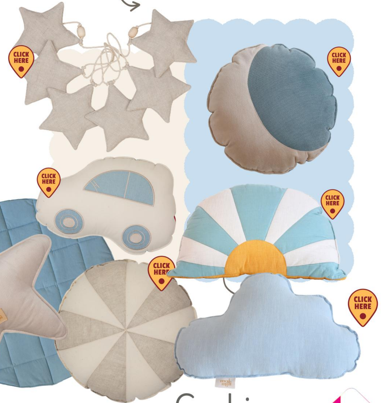
Blue Floor Mat