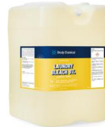
LAUNDRY BLEACH 9% 7016

Extremely concentrated formula designed for high-iron water!