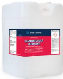
ILLUMINATE BUILT DETERGENT CA3808

One of the most concentrated laundry products on the market today!