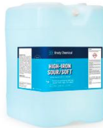
HIGH-IRON LAUNDRY SOUR/ SOFT CA3832

One of the most concentrated laundry products on the market today!