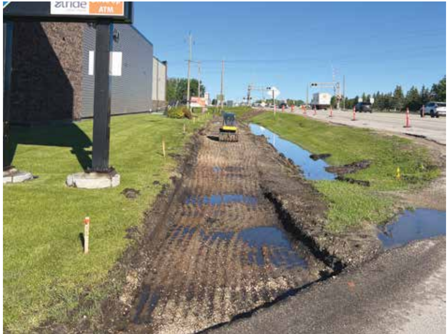
The sidewalk will improve access to shopping, restaurants, and small businesses in the area.

“A construction drawing was then created showing the alignment and elevations for the proposed sidewalk,” explains Phillips. “At this point a list of construction items with estimated quantities, called a schedule of prices, was created. The construction drawing, schedule of prices, and tender documents were then compiled and sent to contractors to bid on the contract.