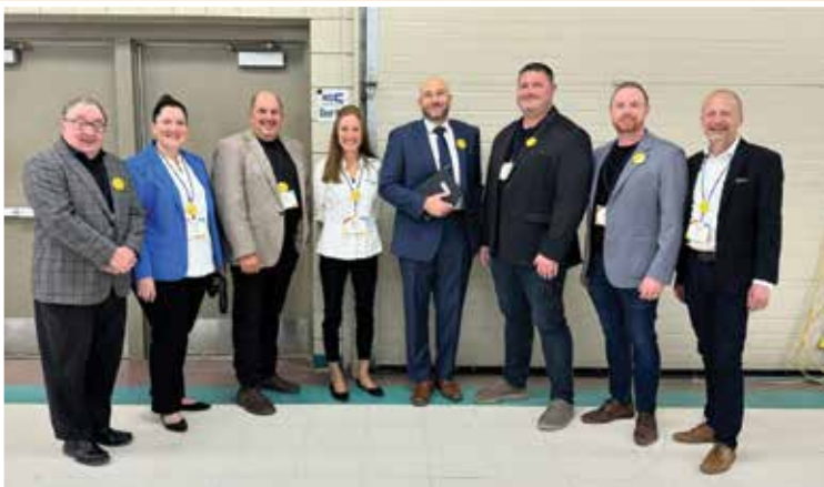
At the Association of Manitoba Municipalities Spring Convention in Brandon, Manitoba.