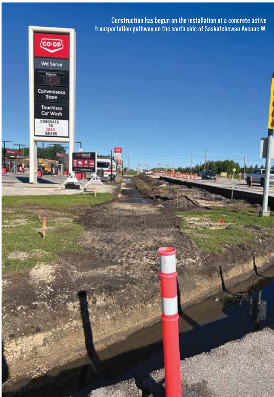
Construction has begun on the installation of a concrete active transportation pathway on the south side of Saskatchewan Avenue W.

Construction has begun on the installation of a concrete active transportation pathway on the south side of Saskatchewan Ave. W. from Elm Street to Shindleman Way.