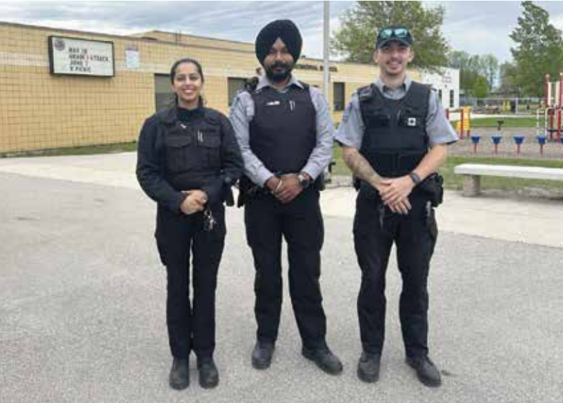
At the present time there are three officers, with a fourth officer to be added at a later date.