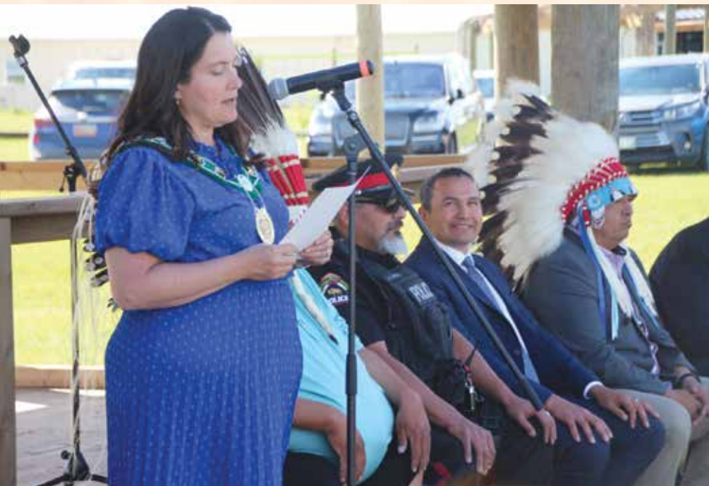
Mayor Sharilyn Knox giving apology to Dakota Plains First Nation on behalf of City of Portage la Prairie.

Article and photos courtesy of PortageOnline