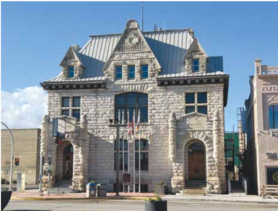
Phase 2 of the renovation of the historic City Hall building is well underway with the goal to make this 125-year-old historical building accessible to the public.