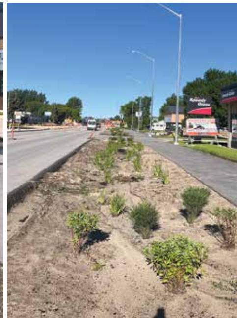
From left to right: Saskatchewan Avenue W.; Bioswales at 19th Street W.; and Bioswales between 18th and 19th Street W.