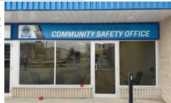
The City of Portage la Prairie Community Safety Office is located at 60 Saskatchewan Ave. E.

The Community Safety Officer Program began in mid April and, to date, there has been a great deal of positive feedback for the program. The officers are now equipped with the tools they need and have been on the streets patrolling.