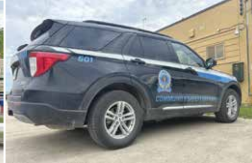
CSO officers perform many duties including regular patrols both on foot and by vehicle, assisting local businesses with safety concerns.