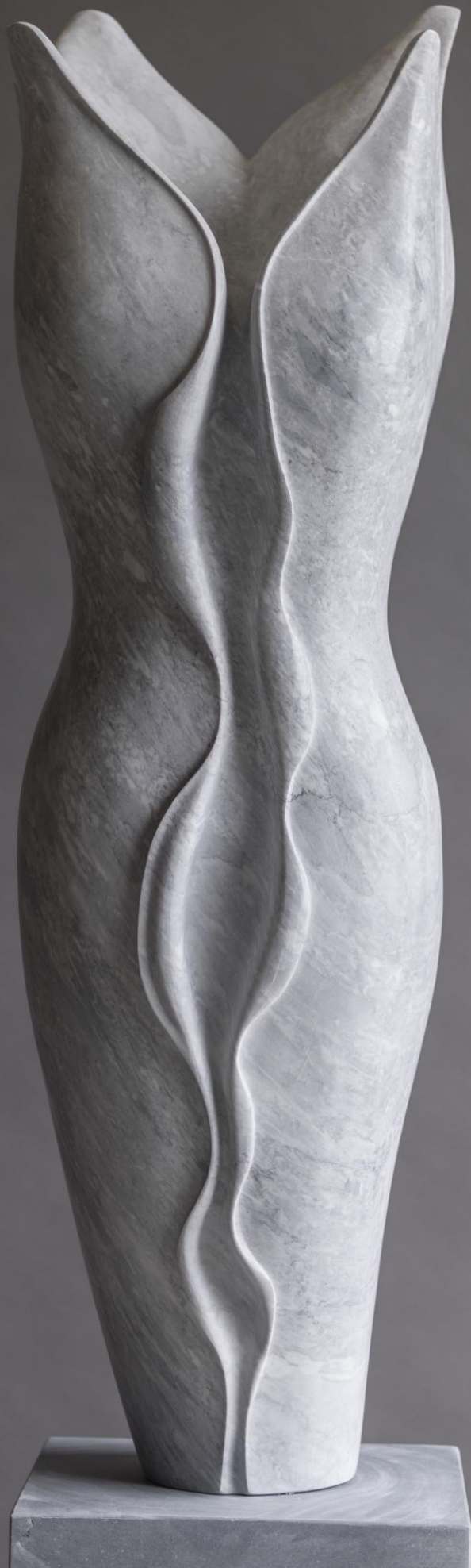
Lucy Unwin Lucy Unwin Sculpture