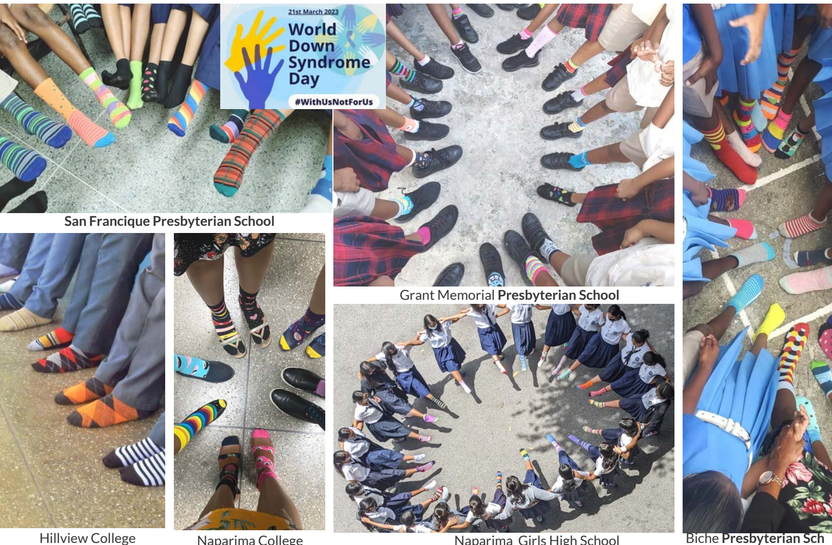
San Francique Presbyterian School