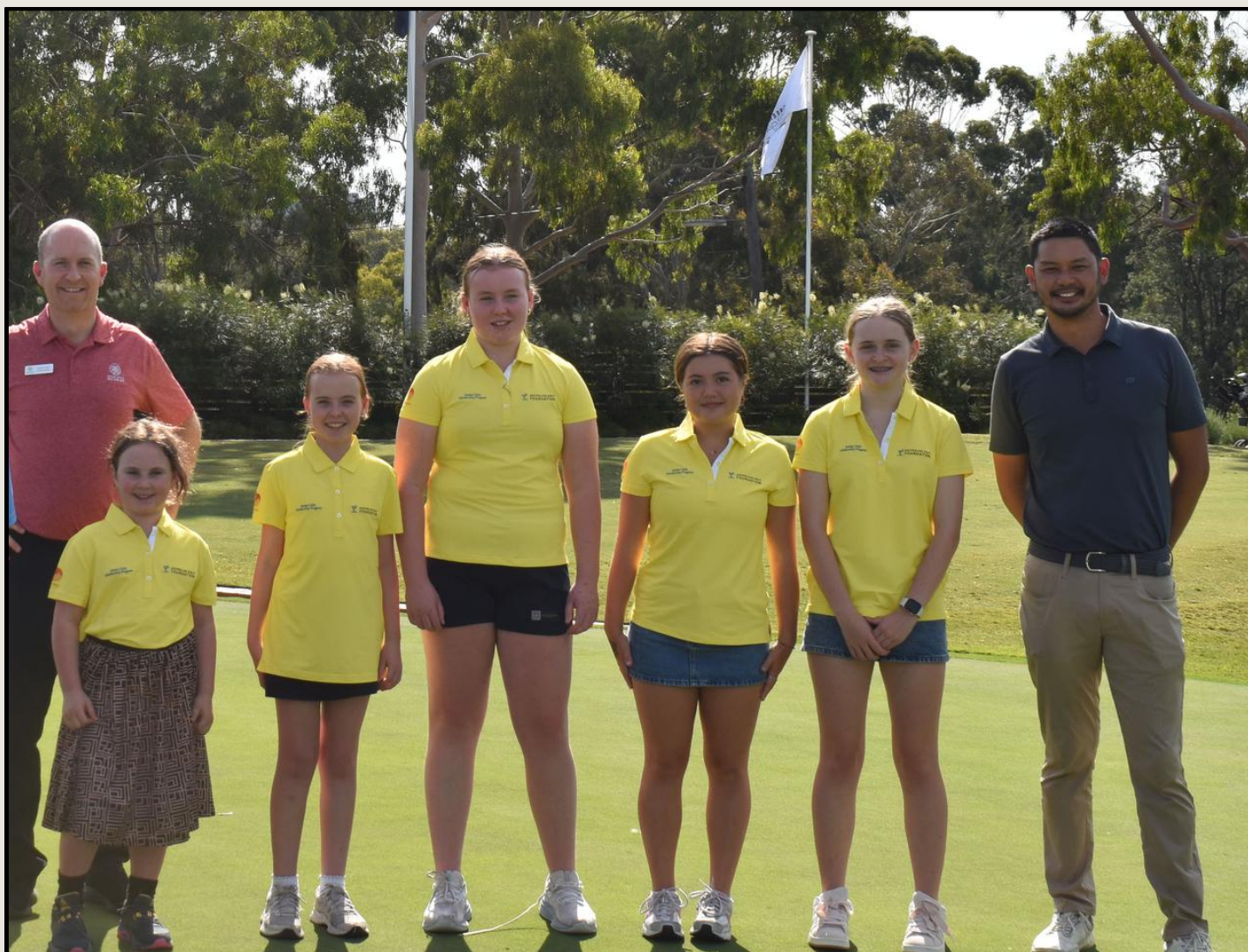
5 of the 2025/26 Girls Scholarship class