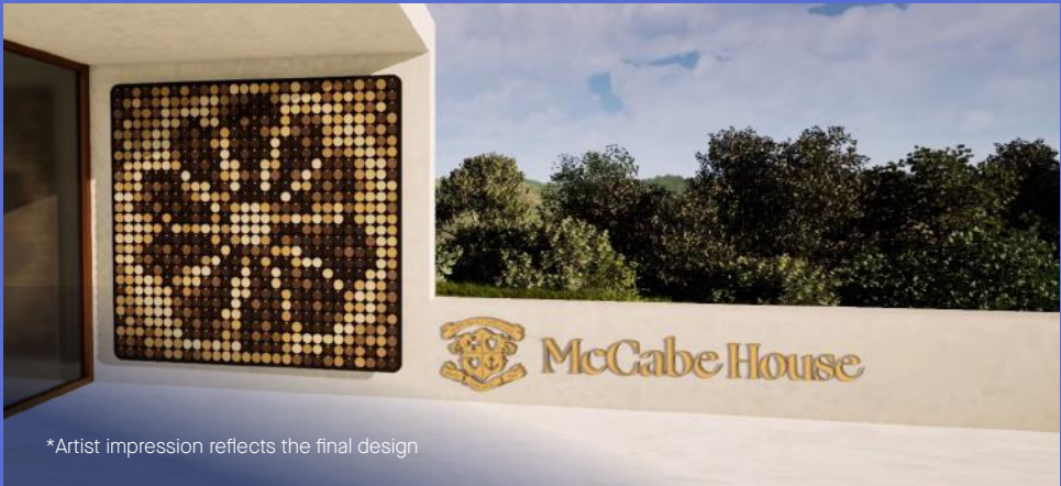
*Artist impression reflects the final design

Above all, 2026 will be celebrated as the Year of Felicity. Rooted in the Loreto value of joy, well-being, and the fulfilment of potential, this theme will guide our philanthropic focus. By framing fundraising around Felicity, we will connect the generosity of our community to the school's commitment to nurturing every student's ability to flourish.