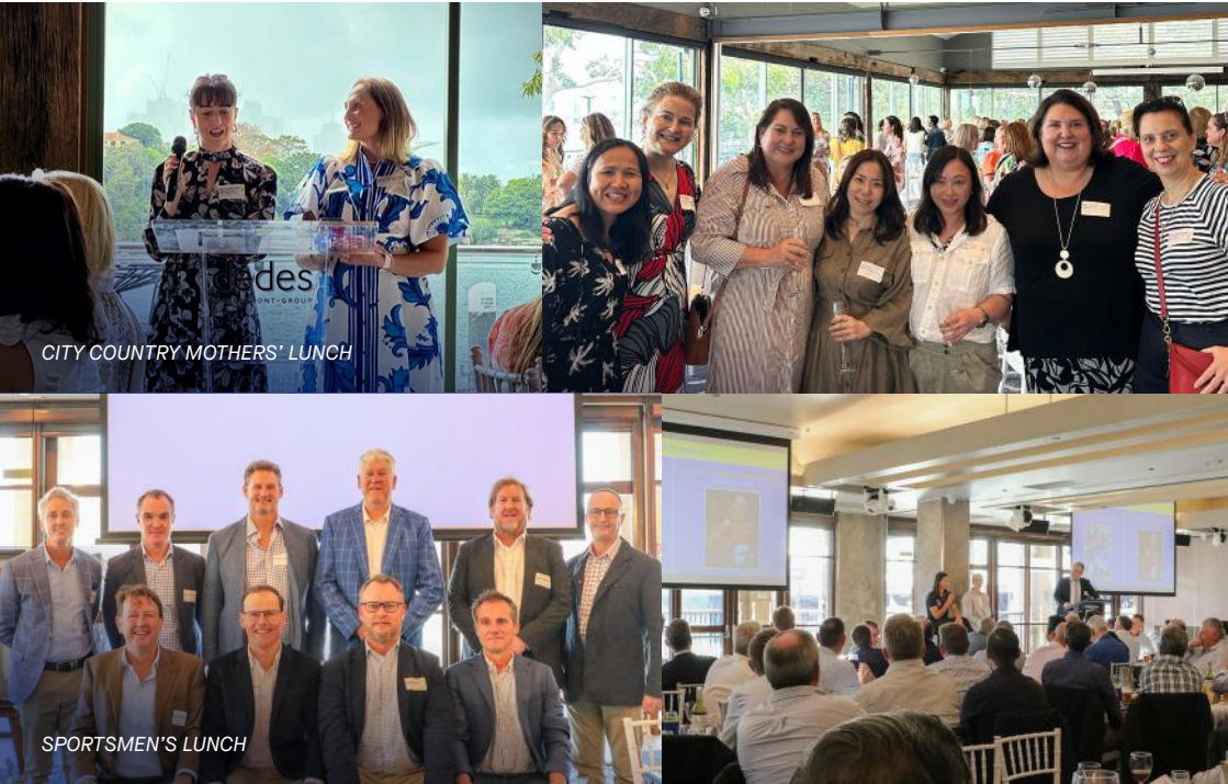
CITY COUNTRY MOTHERS' LUNCH

Together, these events reflect the dual strength of our community — the generosity to make a real difference for students, and the spirit of connection that keeps our Loreto family strong.