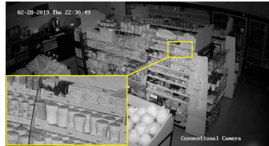
Unable to identify color