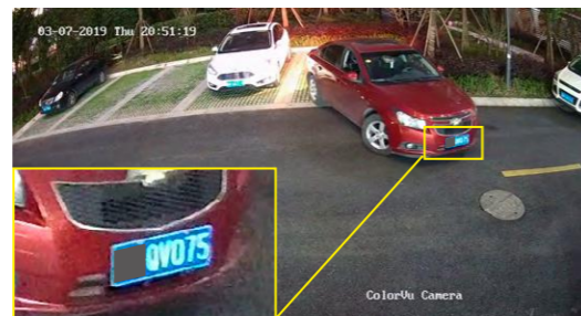
Rich color-related details