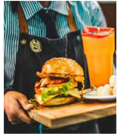
Vellix Adventure Park