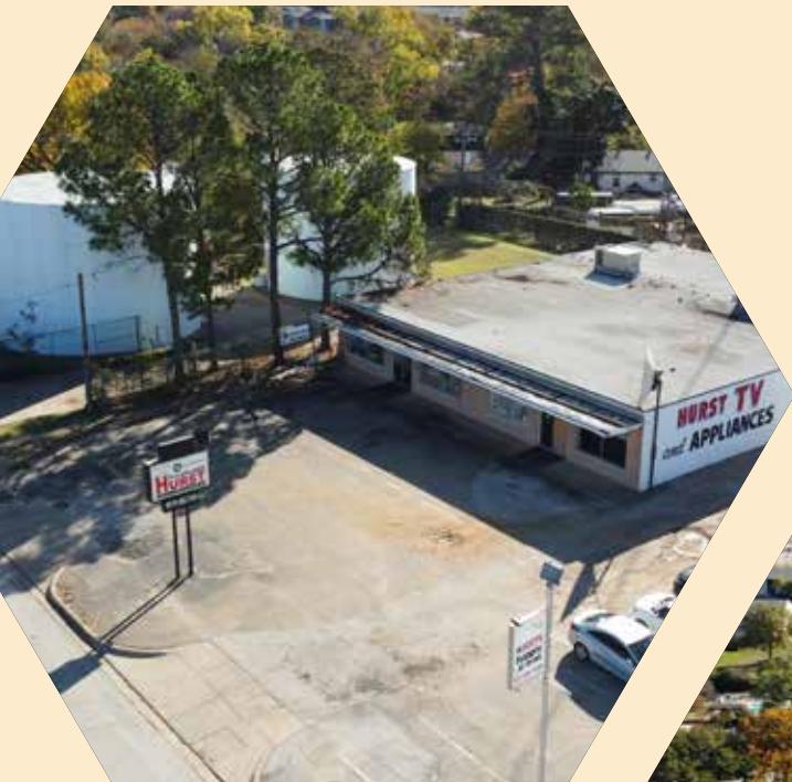
Hurst TV and Appliances

Hurst continues making progress toward long-term redevelopment in key areas of the city, focusing primarily on reinvestment and infrastructure. Several City-owned properties and major corridors are being evaluated, each offering opportunities to support future growth and make improvements for residents and visitors.