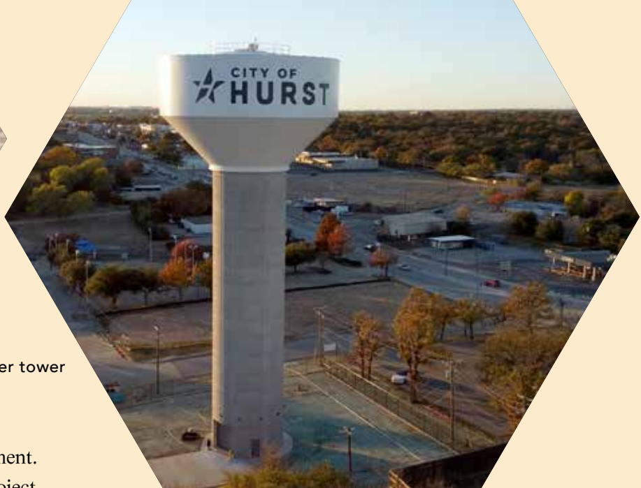
Mary Drive water tower