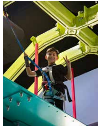
Vellix Adventure Park