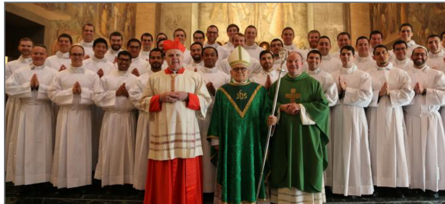
Brent's 3rd year Theology class at the Pontifical North American College