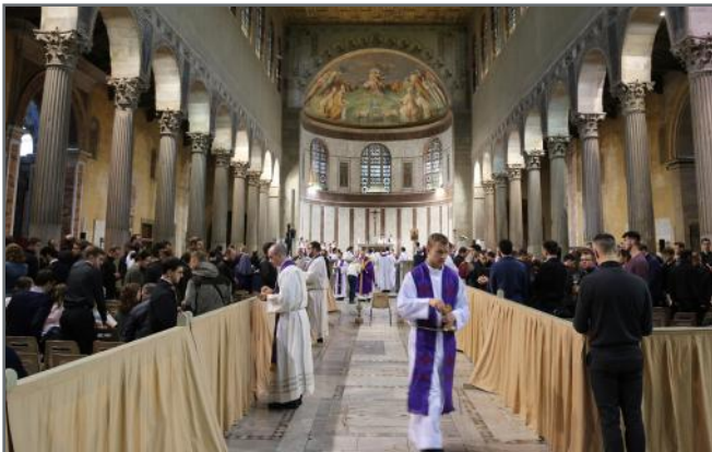
Ash Wednesday Mass in the Basilica of Santa Sabina - the first of the Lenten Station churches