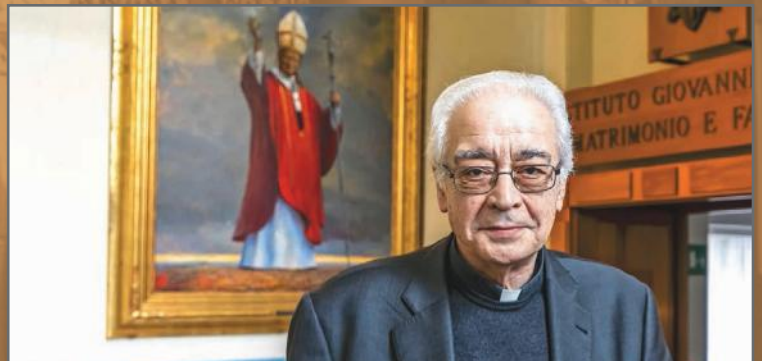
Mons. Pierangelo Sequeri