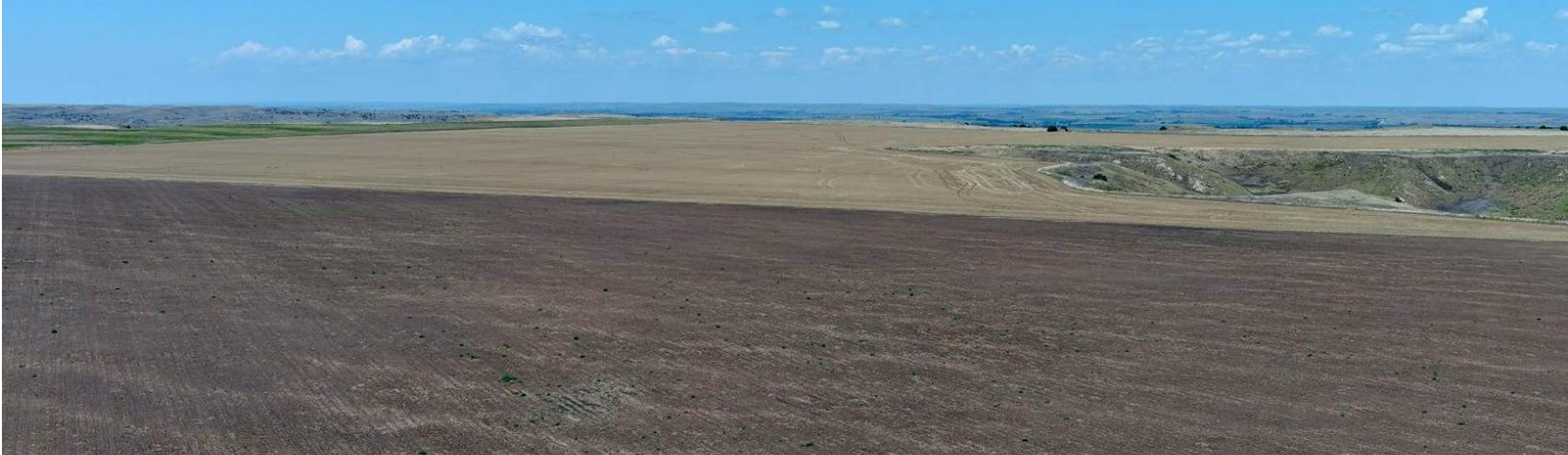
Summer fallow acres & wheat stubble