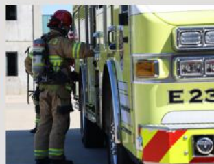
Eagle Point Engine 23 training in White City