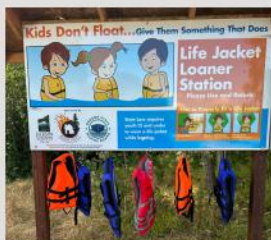
Loaner Life Jackets at TouVelle Boat Ramp