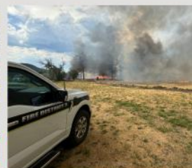
Grassfire on Grant Road (CP) on July 15, 2024