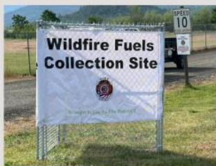
Wildfire Fuels Collection Site at Agate Lake Station