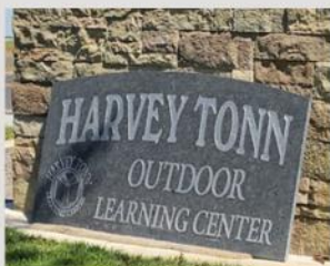
Dedication of the Harvey Tonn Outdoor Learning Center at Scenic Station/Scenic Park in CP