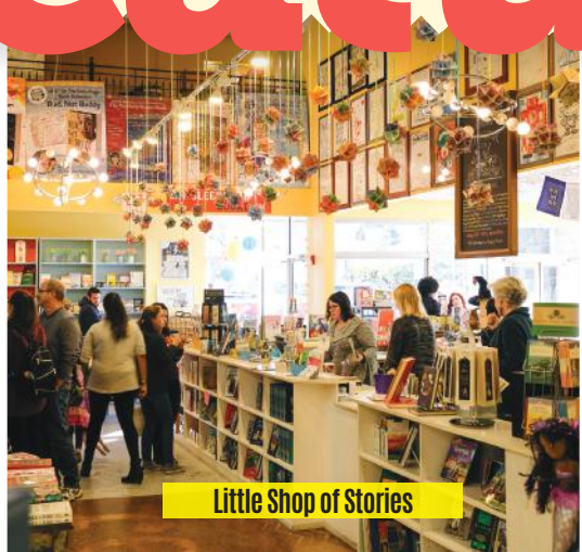
Little Shop of Stories