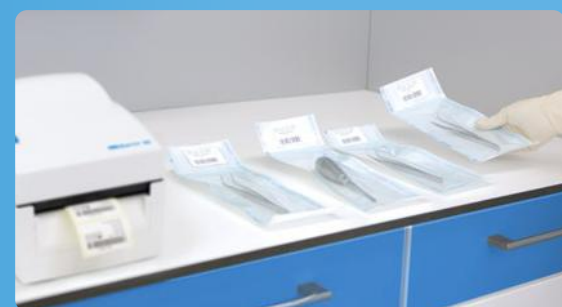
✓ Marking with MELAprint 80