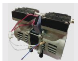
High Vacuum Pump