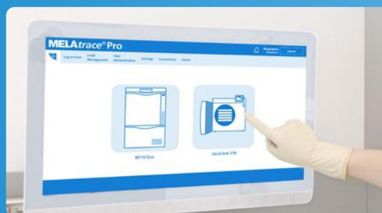
✓ Documentation & approval with MELAt race