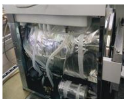
Aluminum Foil Installation