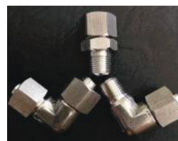
Stainless Steel Connectors