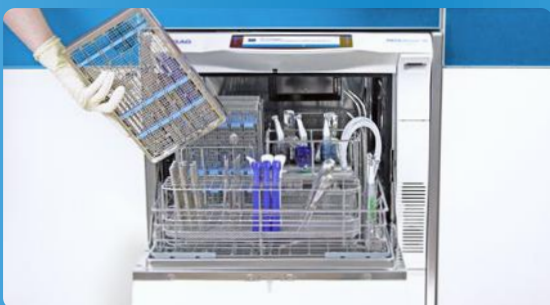
✓ Cleaning & disinfection with MELAtherm

Unique as a product, unbeatable in a system: