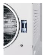
Double Door Lock Protection