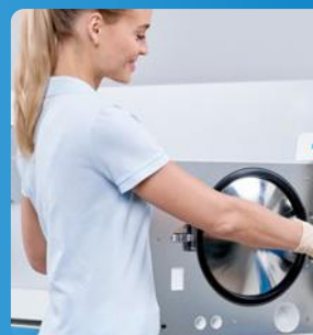
✓ Steam sterilization with MELAster