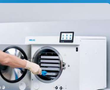
ization with Vacuclave