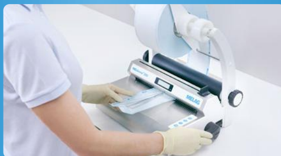
✓ Packaging with MELAseal or MELAstore