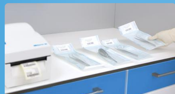
✓ Marking with MELAprint 80